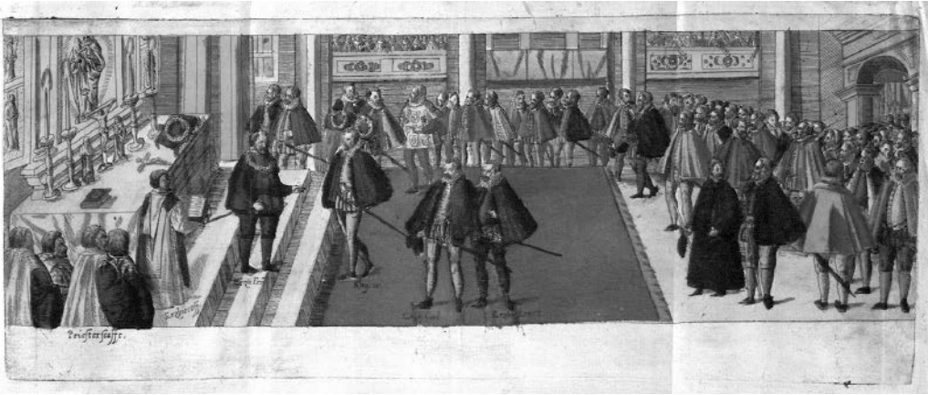
Fig. 1. Anthoni Bays: The celebration of the Order of the Golden Fleece. St. Vitus' cathedral (trumpeters are standing at the upper right balcony). Source: ZEHENDTNER VOM ZEHENDTGRUB, Paul. Ordentliche Beschreibung , illustration between pp. 104 and 105 (©National Library of the Czech Republic. Published with permission.)