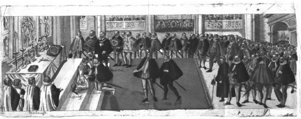
Fig. 2. Anthoni Bays: The celebration of the Order of the Golden Fleece. St. Vitus' cathedral (trumpeters and singers (?) are standing at the upper right balcony).

The main part of the ceremony took place in St. Vitus' Cathedral during a solemn mass. Paul Zehendtner explicitly mentions music performance several times. Firstly, at the moment when the solemn procession entering the cathedral was welcomed by the Imperial trumpeters and drummers. 9 In addition, their participation is recorded during the main