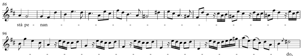
Example No. 23 – coloratura on the word “ penando ”

The first part of part A is closed with a ritornello which introduces a new triplet motive (bars 70–72) that gradually changes in an ostinato the melody of the introductory ritornello. The second part of part A starts at bar 80 and the previous text is repeated. In bars 87–103 there is again coloratura on the word penando with ostinato accompaniment by the instruments; this coloratura is very extensive (altogether 17 bars). It is composed of several rhythmic and melodic figures that are repeated. At the end of the coloratura there are “sighs” again (bar 102).