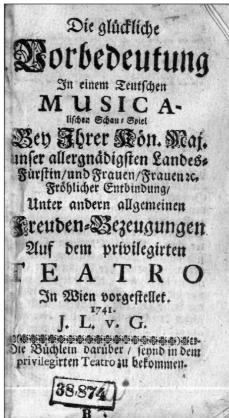
Fig. 1 Die glückliche Vorbedeutung , title page

of the states of the Habsburg confederacy (present-day Ukraine). 25 The original German libretto – as is the case with Hypermnestra – was penned by Johann Leopold van Ghelen.