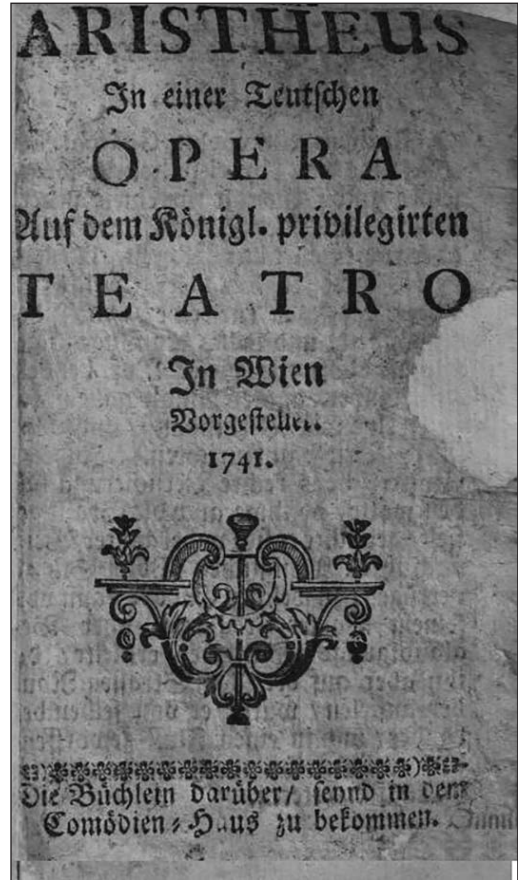
Fig. 3 Aristheus , A-Wn, sign. 26054-A, fol. 3

It follows that Aristheus was not originally intended to be staged in Graz, but in Vienna. It is likely that this copy was left in the Kärntnertortheater after the staging, and to make it usable again, the two above-mentioned sheets were attached to it in the Styrian capital. The other two preserved copies were apparently printed directly for the Aristheus production in Graz. Apart from the tile page for the Kärntnertortheater performance, all three copies are identical.