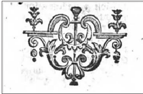
Fig. 4 Vignette, title page of Hypsipile , Aristheus or Didone abbandonata (all 1741)

The title page is similar to that in Aristheus , including the layout of capital letters. The vignettes are also identical.