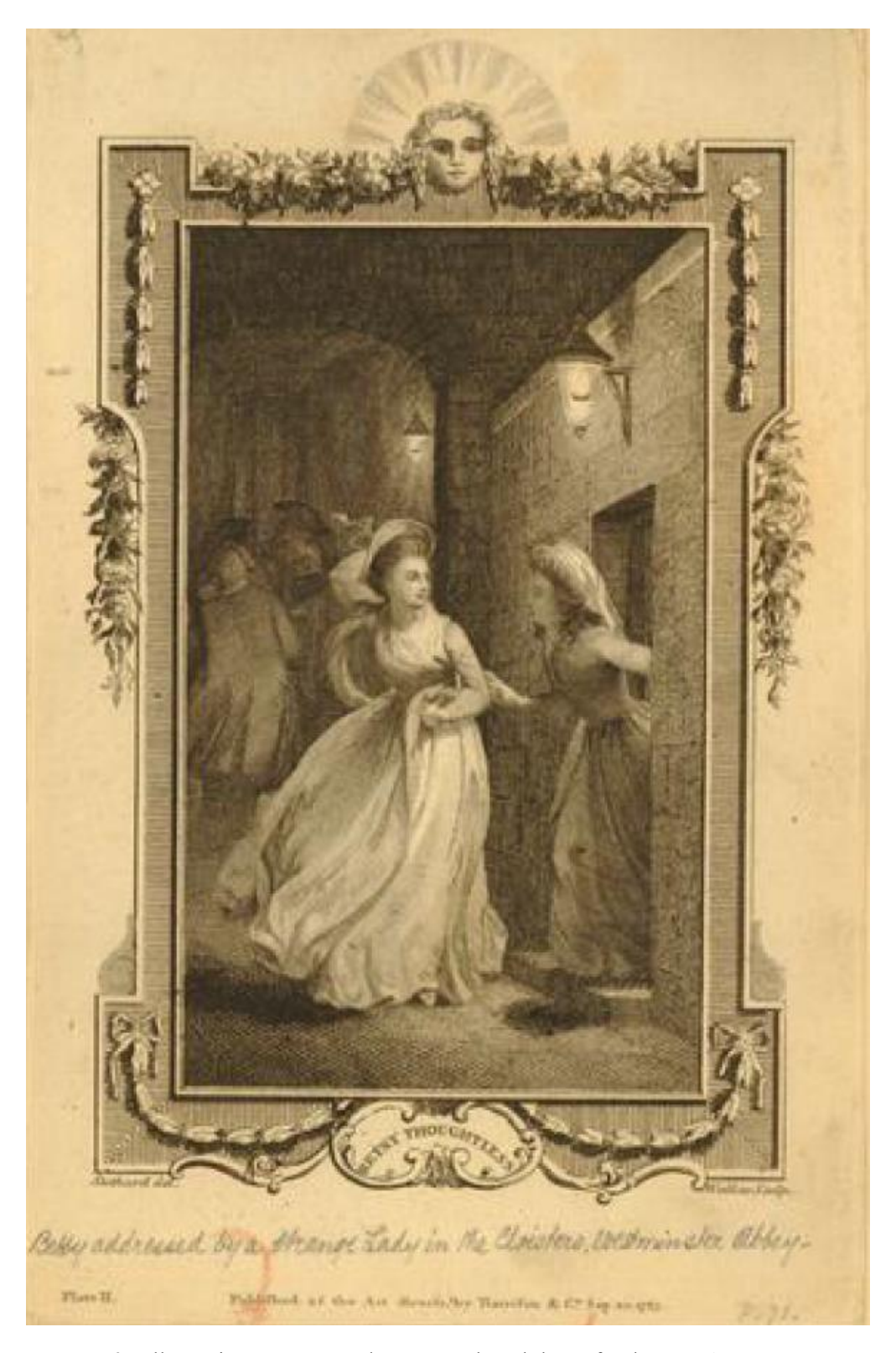
Image 4: "Illustrations to Haywood's 'Betsy Thoughtless,' for the Novelists Magazine " (1783) by James Heath, engraving on paper.