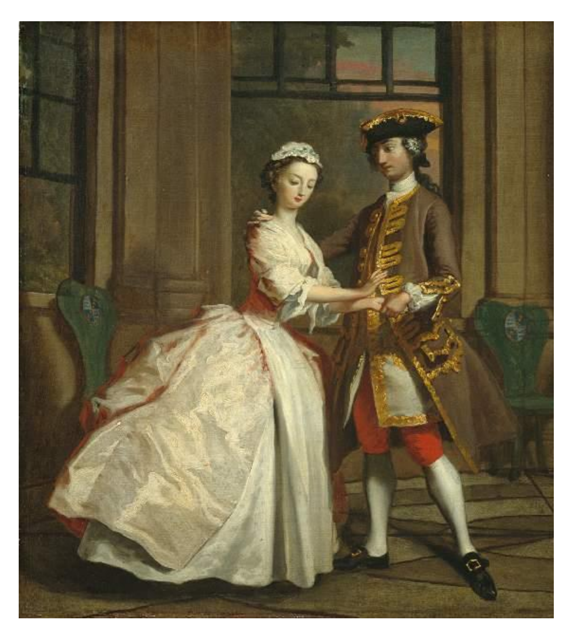
Image 1: "Pamela and Mr. B. in the summer house" (1743) by Joseph Highmore, oil on canvas.