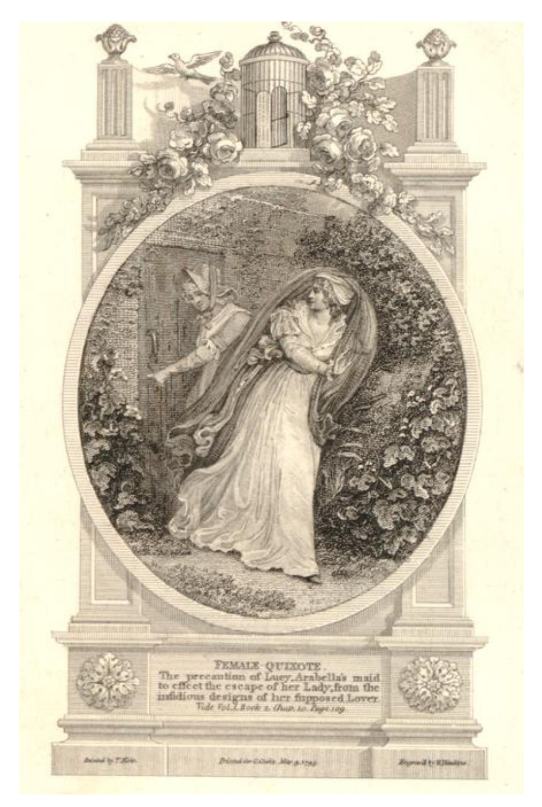
Image 2: "Female Quixote" (1799) by W. Hawkins after T. Kirk's painting for Cooke's Pocket Edition of Select Novels , engraving on paper.