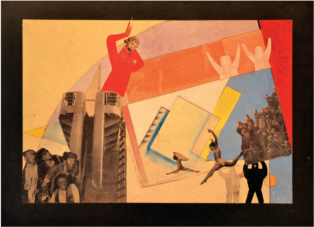
Fig. 3: Avgust Černigoj's sketch for the scenography of Tone Čufer's Tovarna [Factory], 1927. Iconotheque of SLOGI, Slovenian Theatre Institute, Ljubljana, Slovenia.

Musicians and visual artists in the 1980s from various parts of Yugoslavia collaborated and influenced each other strongly. It is perhaps fitting that while the country was falling apart, at a time when hardly anyone on a global scale even mentioned the avant-gardes, its avant-garde artists brought the country together one last time—as they did in the early 1920s when Branko Ve Poljanski published his Svetokret in Ljubljana, Micić his Zenit in Zagreb, and Černigoj enthusiastically emulated the zenitist discourse. (ERJAVEC 2003: 61)