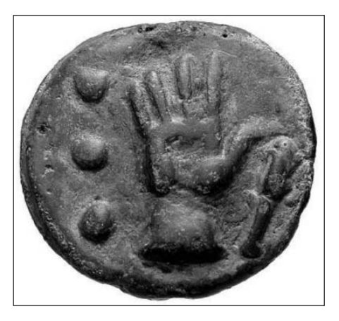
Aes grave with frontal hand

reverse of an aes grave of the mid-third century BC, as an illustration of the manus tendere gesture (37). In Roman art manus denotes the various potencies of the hand to act, to express states of emotion, to convey concepts of possession and power, and to indicate relationships of status (one person of lesser rank than another).<sup>13</sup> In the meeting scene of Anchises and Aeneas the expression palmas tendere aims probably at bringing to the attention of the reader relations of power and social status that the manus symbolized and were part of a traditional value system that was still in fashion in contemporary Rome.