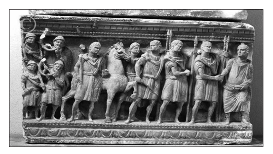
Etruscan urn with military procession, Muzeo Guarnacci, Volterra

Et viridi in campo templum de marmore ponam Propter aquam, tardis ingens ubi flexibus errat Mincius et tenera praetexit harundine ripas. In medio mihi Caesar erit templumque tenebit: