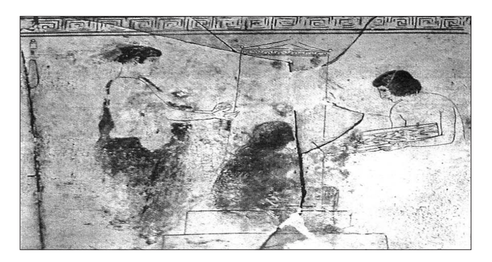
Eidolon (ghost?) of a woman seated on the steps of a tomb attended by two women. Attic white lekythos by the Thanatos Painter (ca.440 BC). National Museum of Athens, 1942. <sup>17</sup>

The Greek passages use the similes \sigma \kappa \iota \tilde{\eta} \epsilon \check{\iota} \kappa \epsilon \lambda o v \ \mathring{\eta} \kappa \alpha \iota \ \mathring{o} v \epsilon \iota \rho \omega and \psi v \chi \mathring{\eta} \ \mathring{\eta} \ddot{v} \tau \epsilon \kappa \alpha \pi v \grave{o} \varsigma to describe Anticleia and Patroclus as life forms but insubstantial. On the other hand, Ulysses describes Elpenor as \epsilon \check{\iota} \delta \omega \lambda o v to draw attention to the exterior shape of the dead (Od.\ 11.83).^{16} We infer that in the Greek source \psi v \chi \mathring{\eta} and \epsilon \check{\iota} \delta \omega \lambda o v describe the dead as an insubstantial but living presence.