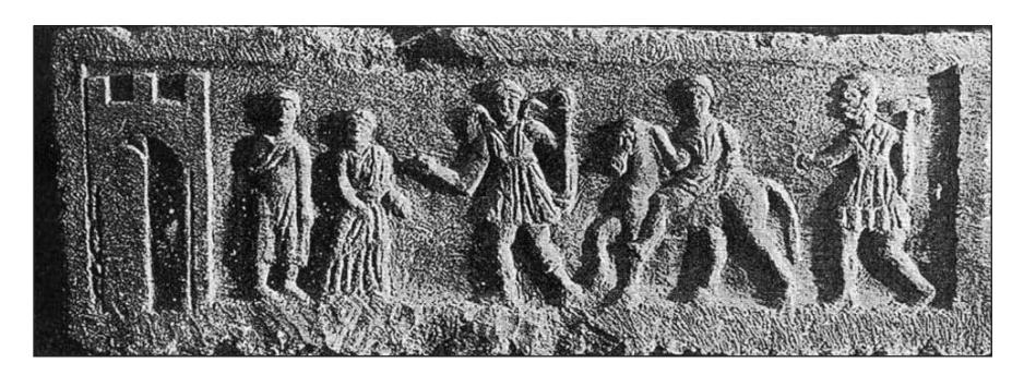
Bruschi sarcophagus. The final stage of the journey to the city of the dead under the direction of Charu(n) and Vanth. 3rd century, Tarquinia, Museo Nazionale

that the scheme was part of the stock-in-trade in Roman popular art which provided illustration for funeral and triumph indifferently (31). The horseman statue on tomb serves to heroicise the dead cavalry man and indicate symbolically his ultimate victorious journey to the afterlife" (Brilliant 54). Haynes suggests that the idea of the journey of the soul to the underworld is Etruscan in origin (29). Starting in the 6th century BC Etruscan sarcophagi show images of the journey of the deceased from the place of burial to the other world, which multiply by the 4th century BC.<sup>38</sup> The dead on horse or on foot travels over land or in a ship. Sometimes the guides that accompany the dead carry swords to defend themselves against menacing beings (64), or the deceased on horse or on foot is accompanied by a guide with sword to clear the road towards the city of the dead from monsters.<sup>39</sup>