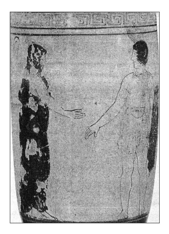
Youth departing. Attic white lekythos by the Houston Painter, ca. 440 BC, Munich, Staatliche Antikensammlungen und Glyptothek ex Schoen 78. (Oakley 71)

hands towards each other in a final farewell gesture at the moment of departure of the dead from the upper world.<sup>27</sup>