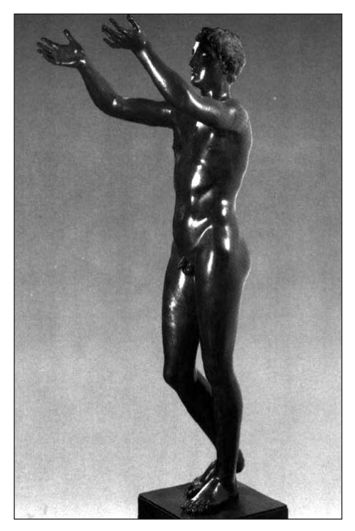
'Adorans' by Boidas, Berlin

funeral reliefs adoring gestures are used to express welcome to a god or the deceased, to indicate social status by marking someone out of the multitude, and to suggest the gesture of offering.<sup>11</sup> Apparently, Virgil describes Anchises' posture in terms of the orans type statues to invest the gesture with ambiguity: a gesture of welcome to a god or to the deceased.