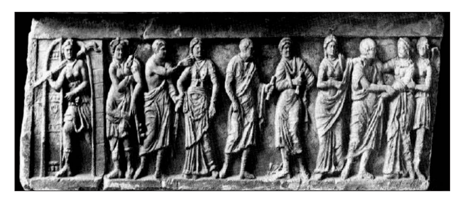
Sarcophagus of Hasti Afunei from Tarquinia, Palermo

Another Volterran cinerary urn depicts a military procession moving towards right. The movement terminates in the figure of an Etrusco-Roman togate magistrate who receives the respectful honors by iunctio dextrarum from the leader of the procession.<sup>52</sup>