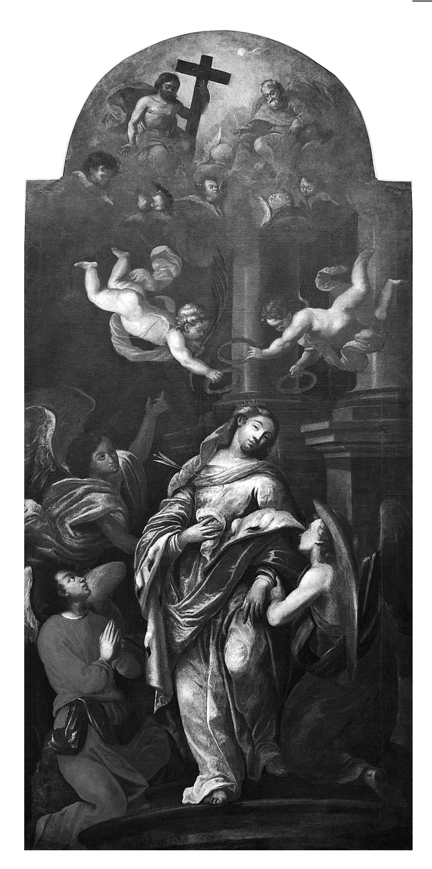
Fig. 4: Peter Auwercx, The Death of St. Ursula, 1711, Ursuline convent, Ljubljana.

ventory of the paintings in the churches of Baroque Ljubljana, Künstliche Mallerey, welche in Laybach zu sehen .<sup>17</sup> Until recently, all these paintings were believed to have been lost, but during the study of the painting collection in the Ursuline convent in Ljubljana, a former