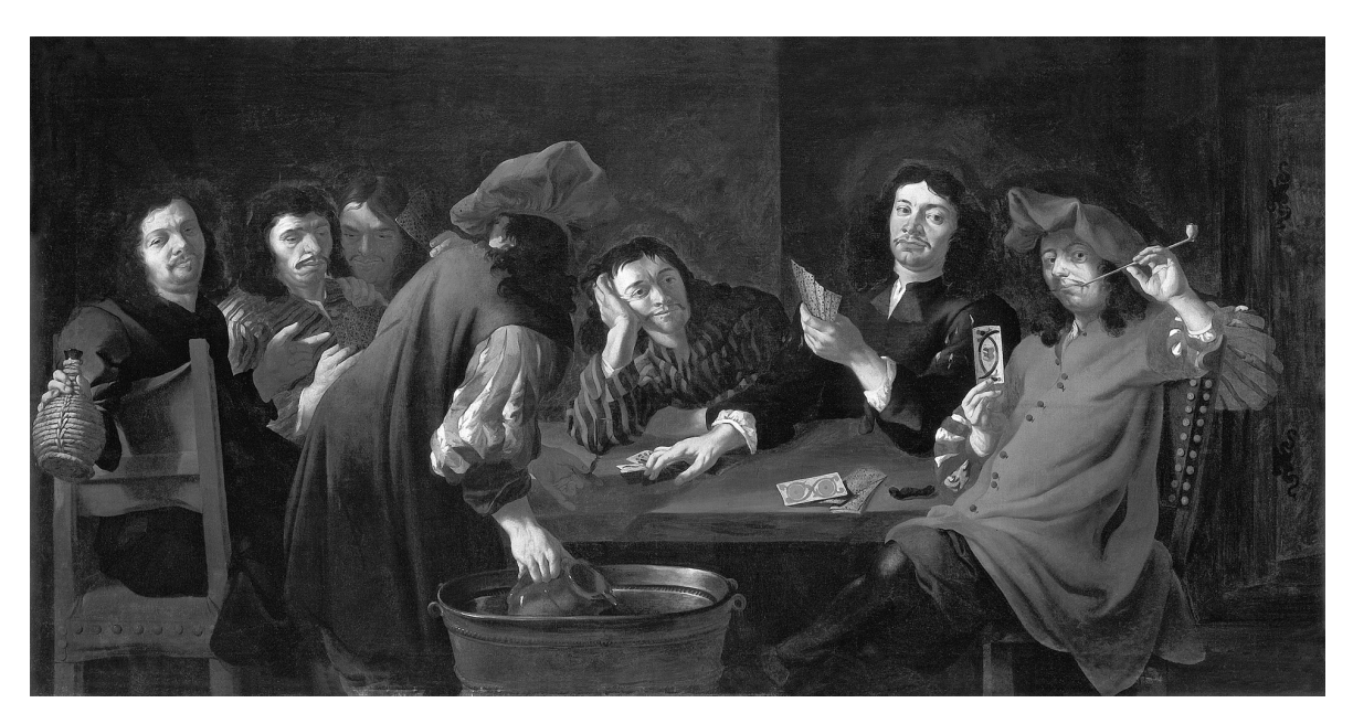
Fig. 1: Almanach, The Card Players II, National Gallery of Slovenia, Ljubljana.