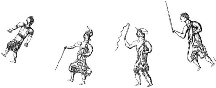
Fig. 4 The Procession of the Sun-Runner, Mainz Vessel