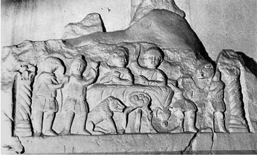
Fig. 1 Reverse side of cult-relief from Konjic (CIMRM 1896.3) Taken over from Manfred Clauss, The Roman Cult of Mithras: The God and His Mysteries , Edinburgh: Edinburgh University Press 2000, 109, fig. 69.

es, 10 usually instigated by the well-known cult-relief from Konjic 11 (fig. 1) that depicts only six persons, some of them wearing animal masks and thus demonstrably grade holders, or one of Porphyry's texts, which again gives some unusual names for Mithraic initiates unattested elsewhere. 12