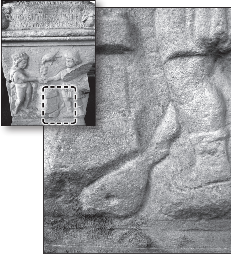
Fig. 5. Bull's limb at the base of the Flavius Aper altar ( CIMRM 1584) from the mithraeum III in Ptuj, Slovenia (with a detail).

After various preliminaries, the subject encounters seven deities with the heads of black bulls, who are said to be the guardians of the celestial axis, 50 and later on another deity who is described in the following manner: