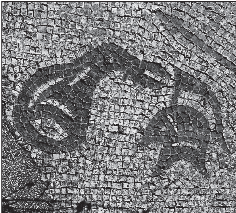
Fig. 2. Detail of the third mosaic panel from the mithraeum Felicissimus with the symbols of the third initiatory grade Miles .

alternative interpretation of the third symbol on the panel of the Felicissimus mosaic ascribed to the grade Miles (fig. 2), since we are of the opinion that this object has been incorrectly identified in previous scholarship.