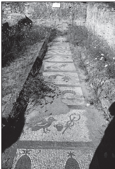
Fig. 1. Floor mosaic from the Felicissimus mithraeum (CIMRM 299).

The main part of the mosaic that decorates the floor of the mithraeum aisle is organised as a series of seven panels, which cover the entire area between the two lateral podia where the worshippers reclined for their common banquets (fig. 1). The decoration of the entrance area, and of the area immediately in front of the cult-niche in the back wall, where the tauroctony, the main cult image of Mithras killing the bull, would have been situated, follows a different scheme. 8 The seven panels contain symbols of the Mithraic initiatory grades. In most cases, each grade is represented by three symbols; in two cases (Persian and Father) by four. 9 With