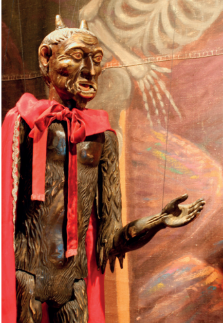
Fig. 14: Marionette of the Devil from the Flachs family exclusive set of the 'Berouseks'.