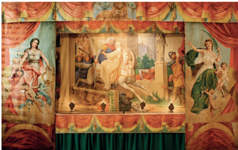
Fig. 12: The curtain of the theatre of Jan Flachs Jr. 'Břetislav and Jitka' with the upper portal flat. Painted by Jan Vysekal of Kutná Hora, late 19 th century. 340x170cm.