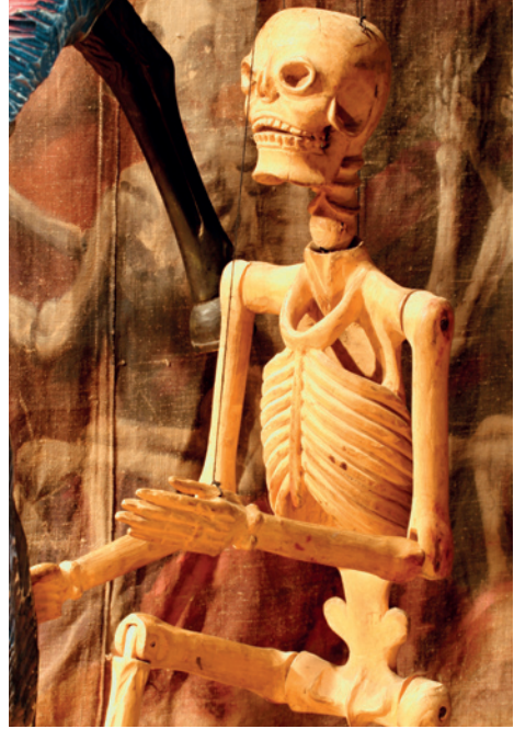
Fig. 15: Marionette of Death from the Flachs family exclusive set of the 'Berouseks'.