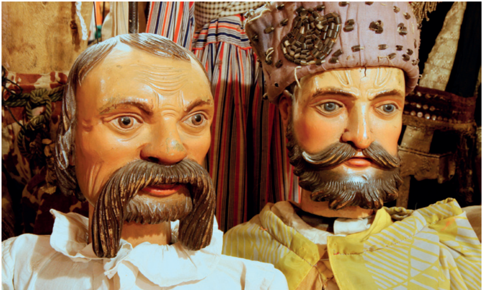
Fig. 16: Marionettes of the Peasant and the Count from the Flachs family exclusive set of the 'Berouseks'.