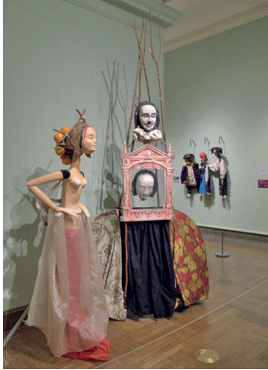
Fig. 1: Installation of figures from Petr Matásek's designs for Miranda and Prospero from The Tempest (2002), collections of the Naïve Theatre, Liberec.