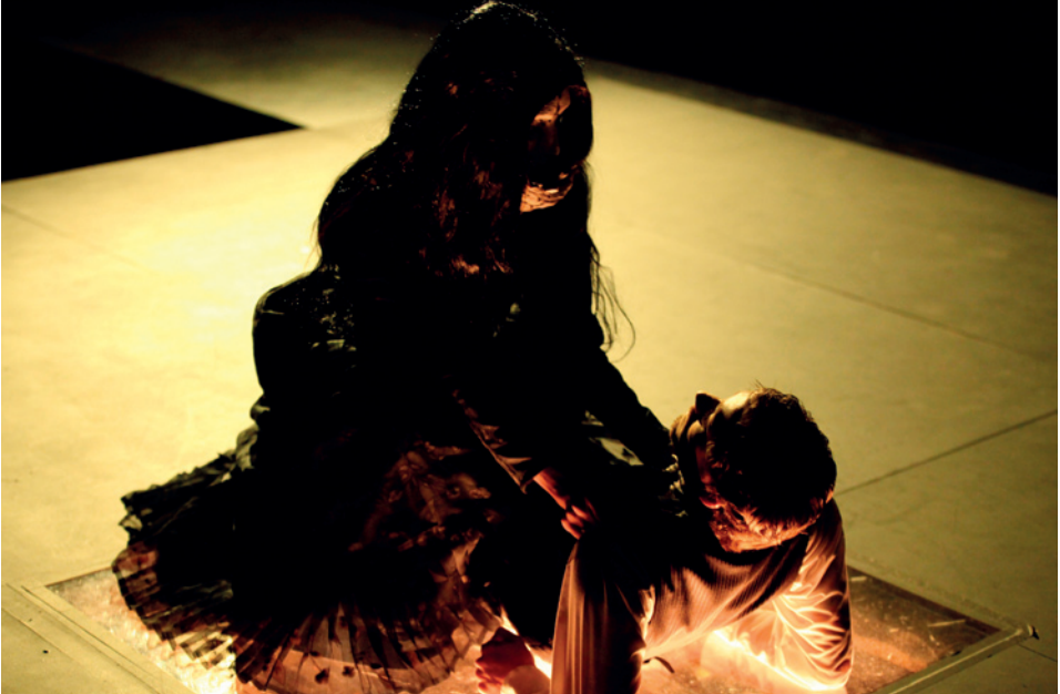
Fig. 6: Production photograph from the Ohio State University production of aPOEtheosis showing Poe tormented by a horrific vision in the 'light box.'

owly figures of anything illuminated by it; the illusion of a bank of seats that mirrored those in the auditorium and which split open to reveal a door to hell/eternity/another world; and, most importantly, a puppet-inflected mannequin of a woman which could be manipulated by actors and deconstructed/reconstructed as needed in the production. The latter object was designed by Petr Matásek and then built by master craftsman Jiří Bareš in his workshop near Hradec Králové. 2 It was shipped to the United States for the production and was then acquired by the Czech Collection at the Theatre Research Institute at Ohio State University after the performances ended. Matásek gave this object the punning name Marion Lee, an acknowledgement of a famous character from Poe (Annabelle Lee) and the stringless 'marionette' influences that it displayed.