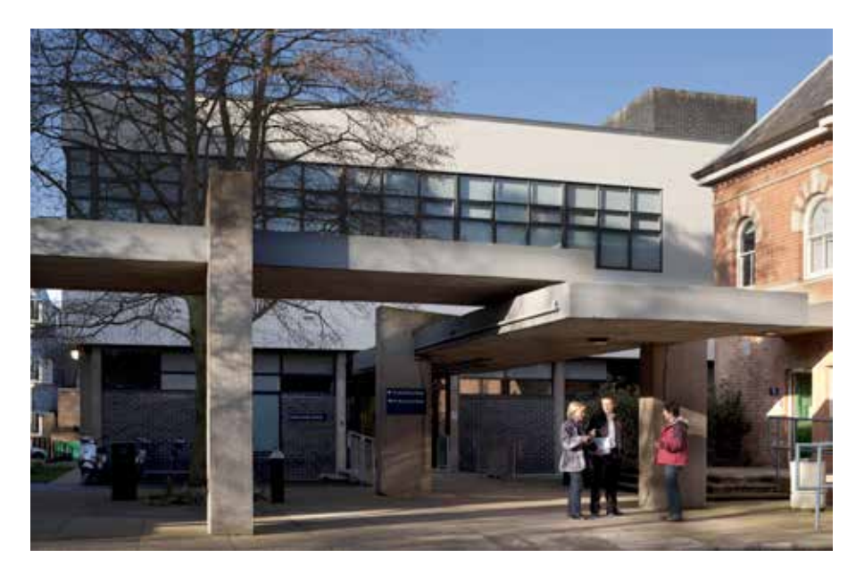
Figure 2: The University of Leicester School of Museum Studies in 2009