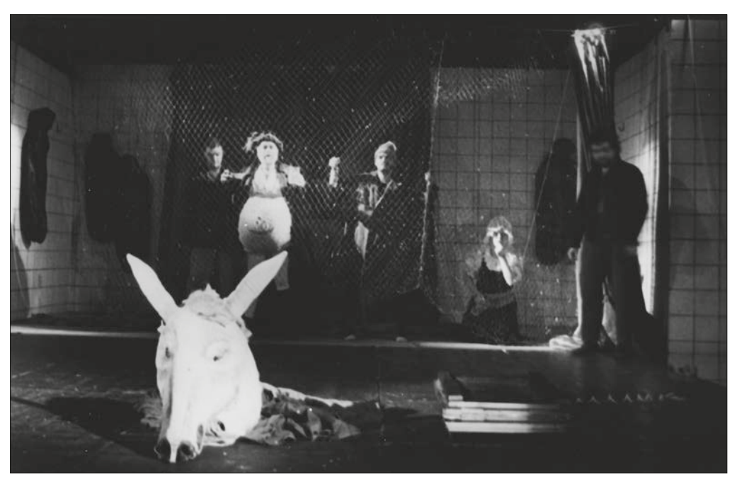
Fig. 3: Their Majesties Fools.

Again, according to Scherhaufer, the staging intention was to perform the play as if in the period when ... the theatre 'went haywire' <sup>13</sup>. There are Hamlets everywhere, and everyone keeps asking Hamlet questions: Does it make sense to live? How should we exist in times when having means more than being? Should we rather sleep and cease to exist? (SCHERHAUFER 1996: 177).