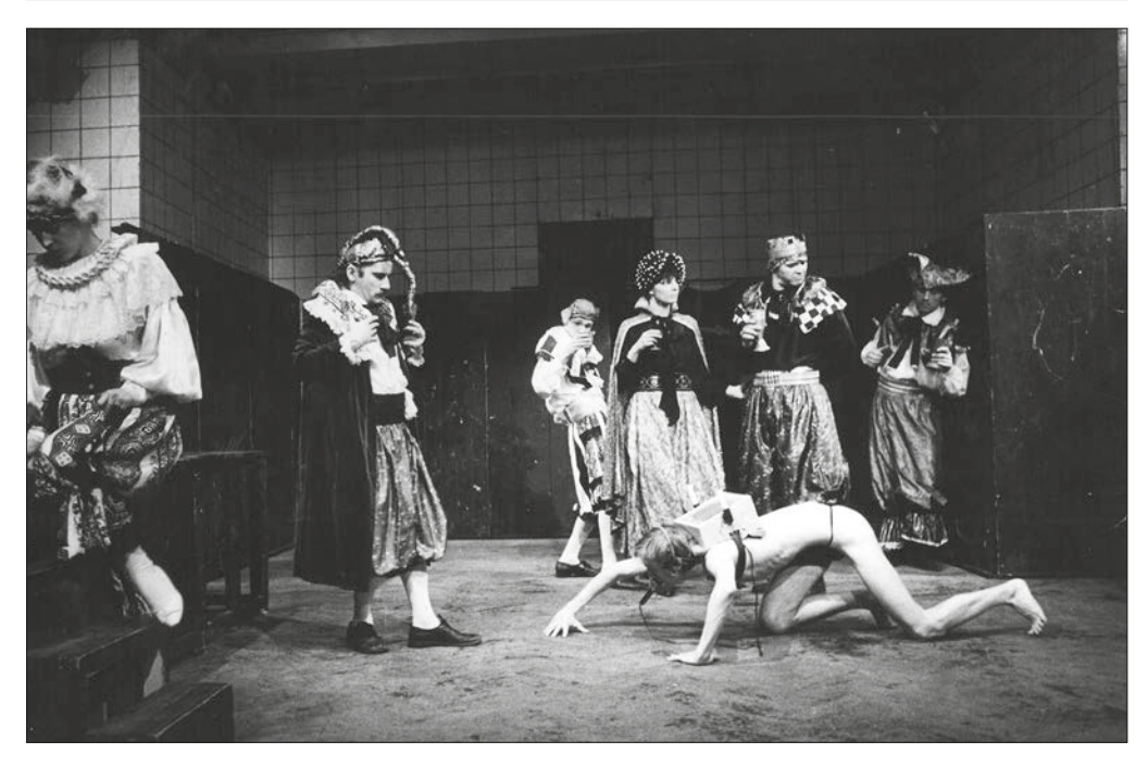
Fig. 2: The Hamlet Humans.