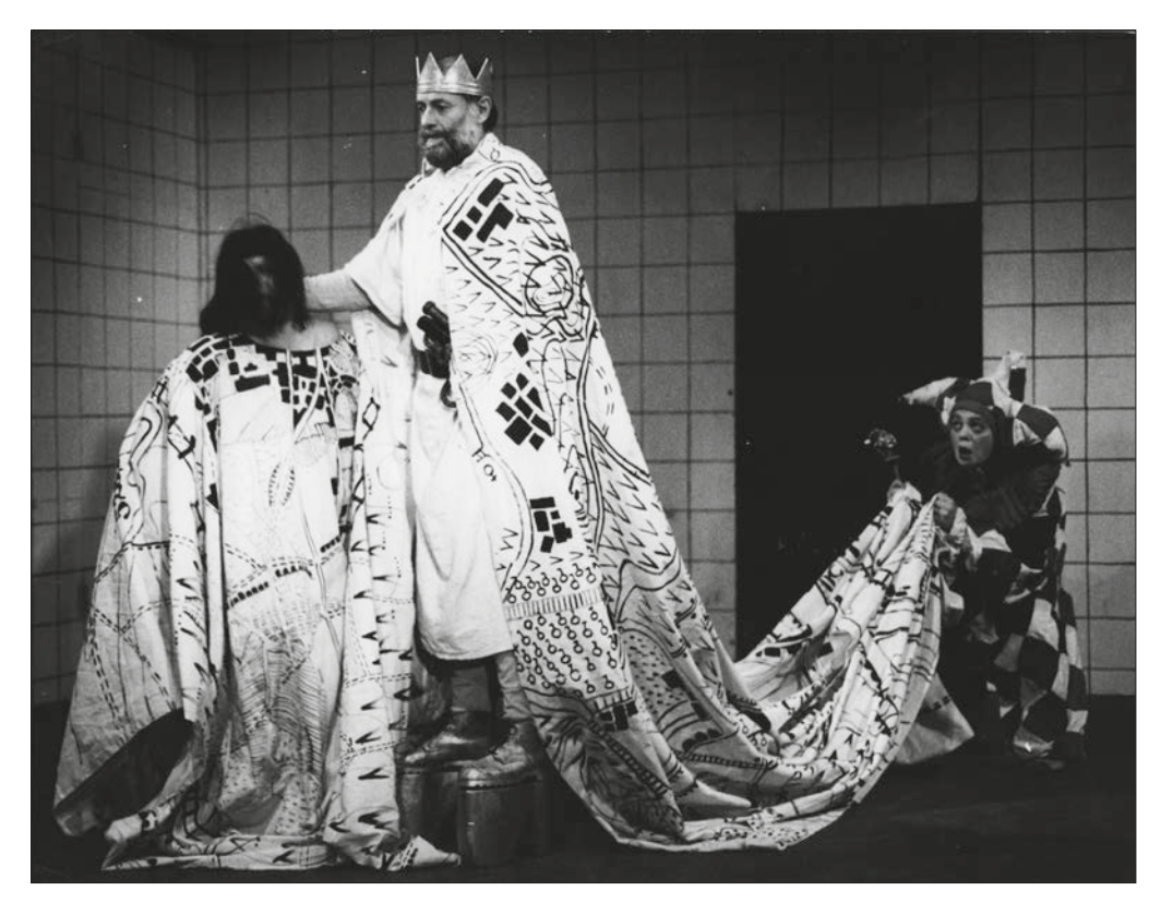
Fig. 4: A Man Tempest.