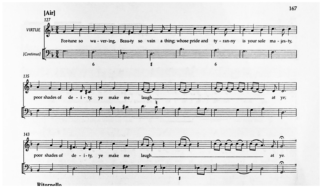
Ex. 1 F. Cavalli - L'Erismena, aria of Virtue, bars 127-150.

It's always a good thing when discussing love and virtue in opera to actually have a character called "Virtue" who sings her own aria. And so we do at the very beginning of Cavalli's L'Erismena . And this sober aria, mocking Beauty and Fortune sets the tone in which the actions of the opera take place.<sup>1</sup>