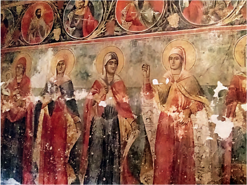
Fig. 6. The use of local female beauty in frescoes in addition to didactic orthodoxies, Saint Apostles' church, Hoshtevë, Albania

The use of local female beauty in decoration – in our case, the same face in different positions – has been observed in many Orthodox churches. The figures have an aristocratic appearance, and it is likely that their purpose is to encourage a kind heart, sensitive femininity, and a loving disposition.