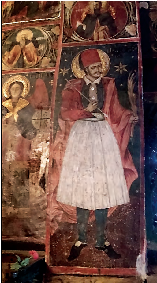
Fig. 4. Saint George of Ioannina or Saint George junior, Saint Apostles church, Hoshteve, Albania

The data presented in Fig. 3 show how the box plot compares to the probability distribution function for a normal distribution of our case study, which considered 8787 tourists visiting the area. So, the median line is moderately high (4832), while the variability is relatively high, since the respondents are in interquartile boxes. This is clearly shown by the longer box, which reflects the greater the variability of the distribution. The figure clearly shows that this is a left-skewed distribution, as the median is closer to the higher values of the box.