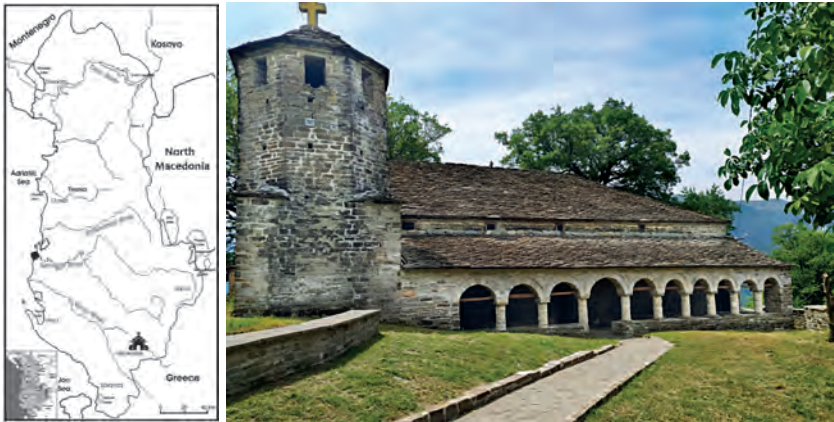
Fig. 1. Site location and external view of the Saint Apostles Church in Hoshteve, Gjirkastra, in the Zagoria region of south Albania

This study focused on the Saint Apostles Church, which is located in the village of Hoshteve, in the Zagoria region of south Albania (Fig. 1). The in-situ identification of different aspects related to religion was based on photo records and measurements at the church, collected during a field trip. The authors carried out a literature review and analysis of the several methods for achieving religious resilience from both a historical perspective (focused on the period of the post-Byzantine era) and an art history perspective associated with mural frescoes. In particular, the focus was on investigating possible research and methodological choices in understanding religious tolerance in Albania, and establishing a key connection to the main elements revealed in the Church of Saint Apostles through a study based on the local context. To achieve this, two research topics were formulated: First, to what extent are travel and site visits motivated by an interest in nature, religion (including heritage, both Christian and Islamic), food, and/or other factors? Second, what is the role of a specific religions' heritage, both tangible and intangible, in pursuing local tourism development and sustainability.