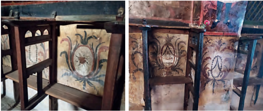
Fig. 5. Paleochristian decorations dominating the lower parts of murals in Saint Apostles church, Hoshtevë, Albania