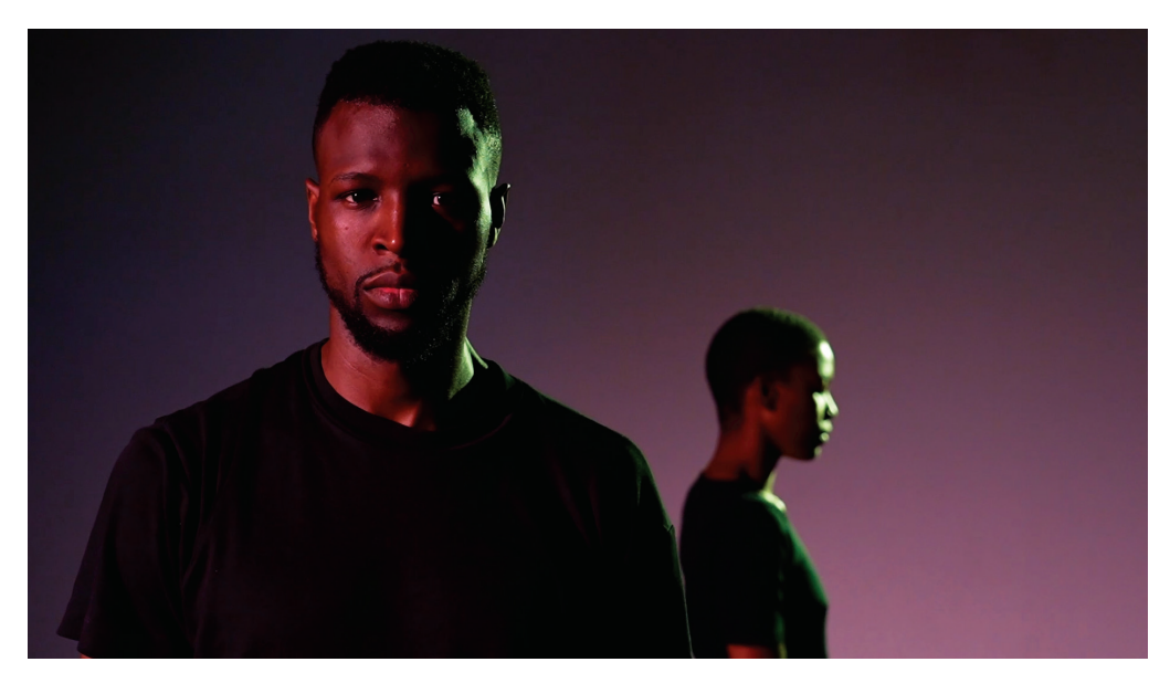
Fig. 8: Colours in Between by Raquel Rosildete.

contexts. As Napo argues, 'we have to be the narrators of our own history/herstory'.<sup>30</sup> By disclosing images and procedures, I seek to highlight the identities to which the imaginary is associated, so that they are discussed, problematised, reinvented.