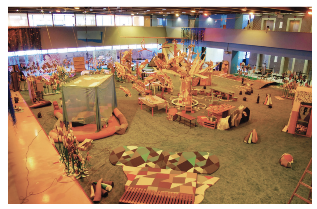
Fig. 4: Tree of Life, São Paulo, 2010.