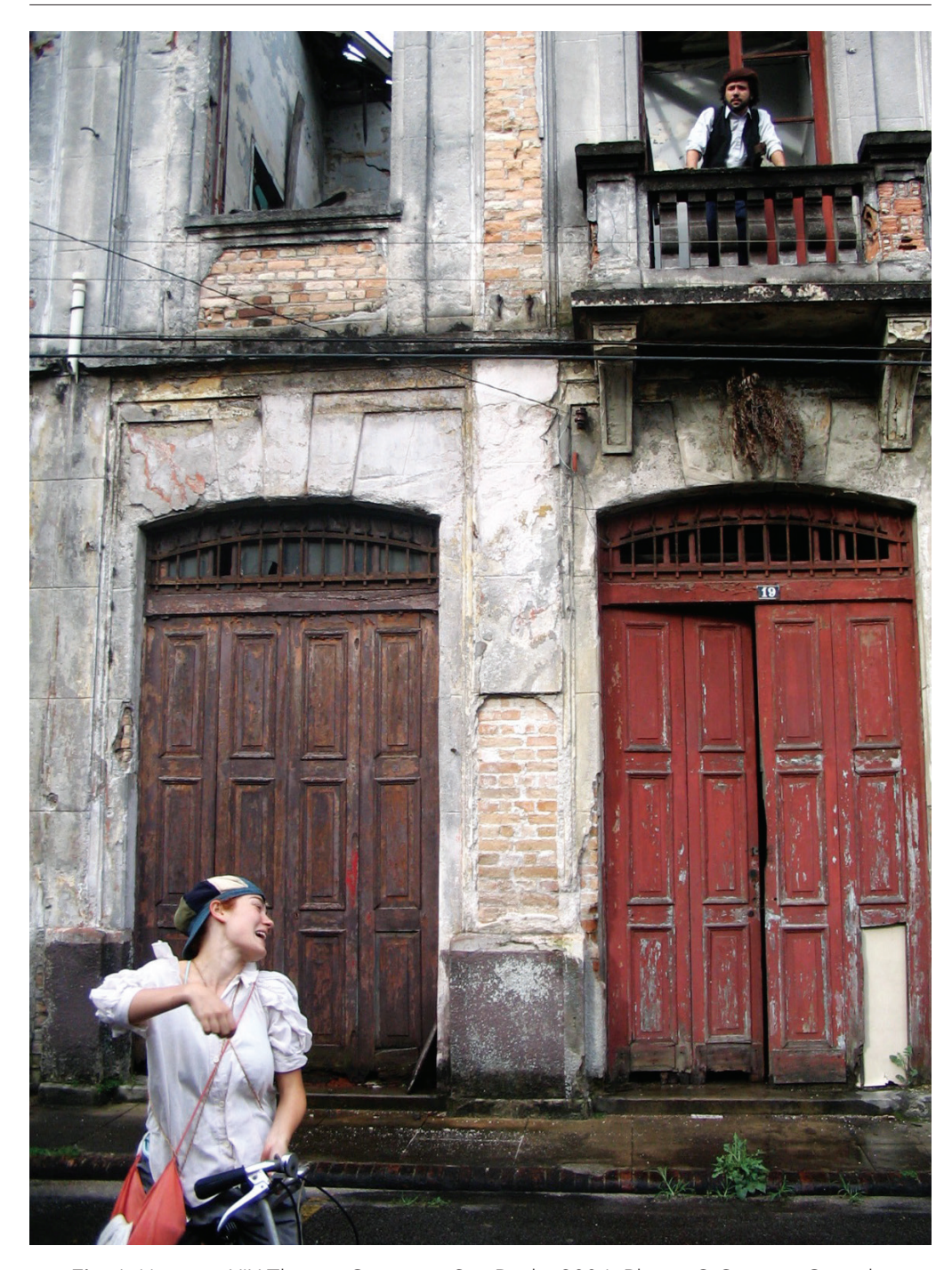
Fig. 1: Hygiene, XIX Theatre Company, São Paulo, 2004.