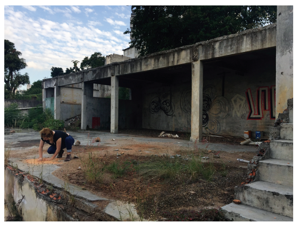
Fig. 2: Workshop 'Poetics of Destruction', São Paulo, 2010.