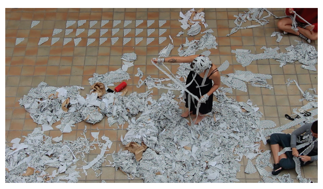
Fig. 3: Research group 'How to Cross the Devastated Field', São Paulo, 2017.