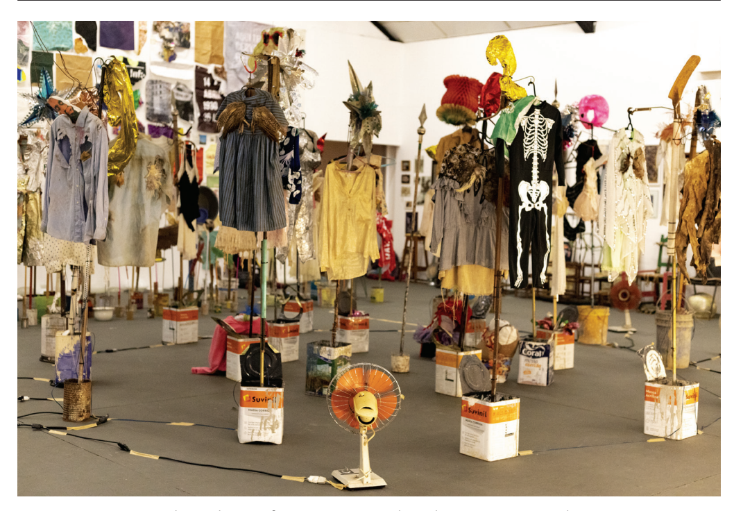
Fig. 6: The Cabinet of Disinterests and Mediocrities, São Paulo, 2023.

of the world during the Age of Discovery. However, while, on the one hand, there was a sense of wonder at the richness, sumptuousness, and exuberance of exotic species and artifacts, this practice was built on the progressive destruction of colonised territories in the process of decimation of ecosystems. So, I propose turning curiosity into disinterest and marvels into mediocrity.