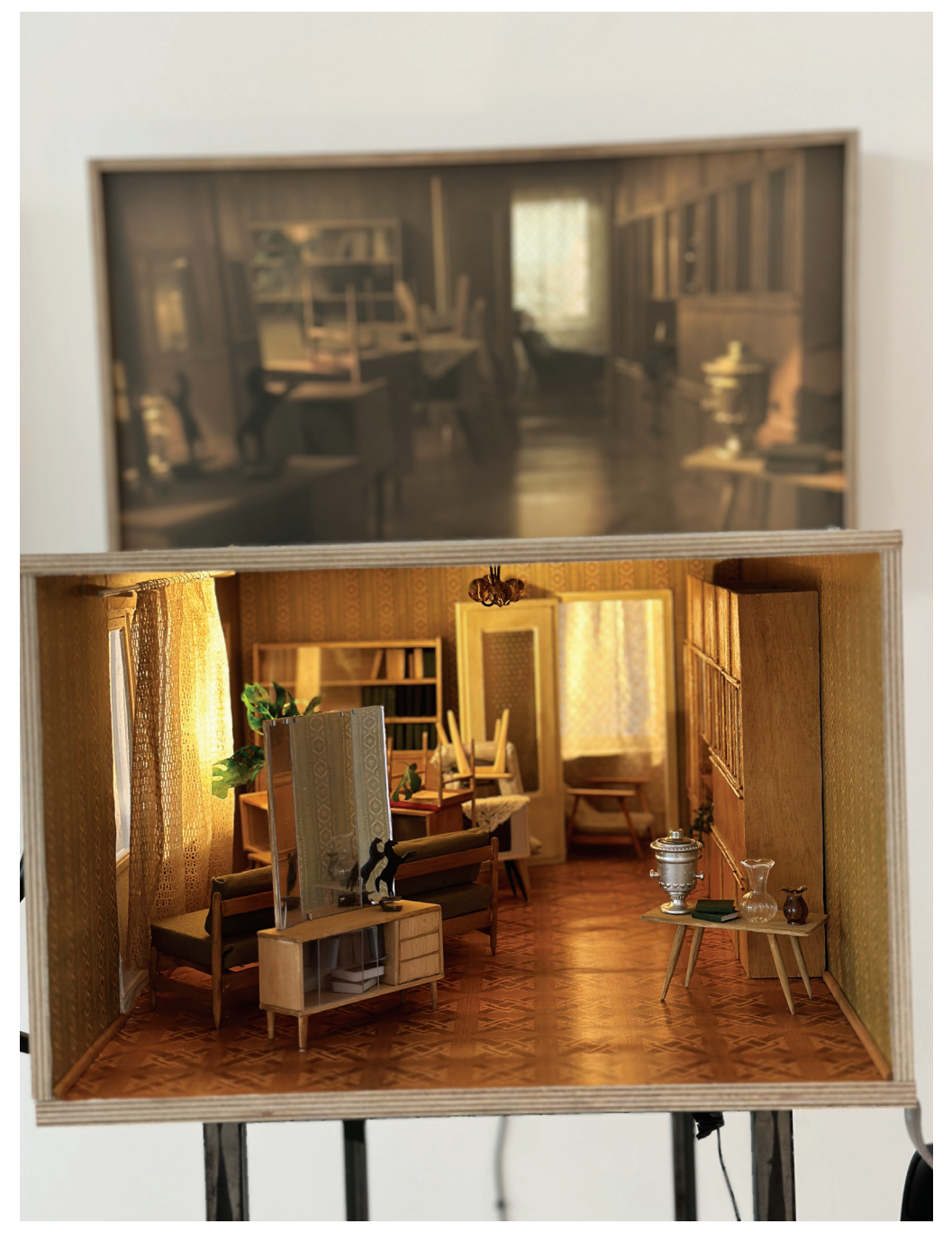
Fig. 2: Lithuania: Reconstructing Memories by Auguste Kuneviciute. PQ 2023.