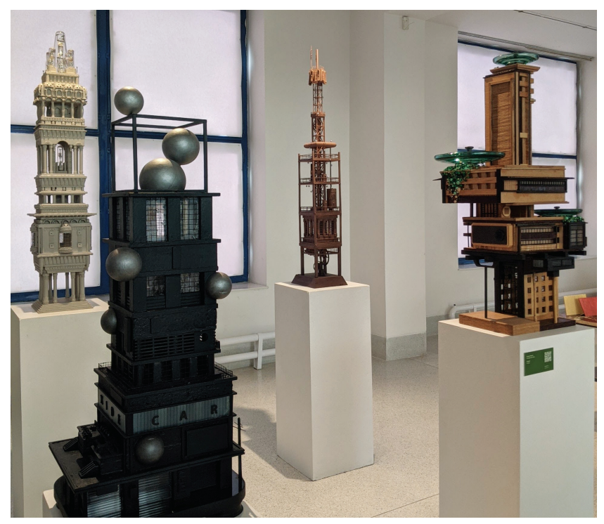
Fig. 7: Finland: Energy Towers by Kalle Nurminen. PQ 2023.