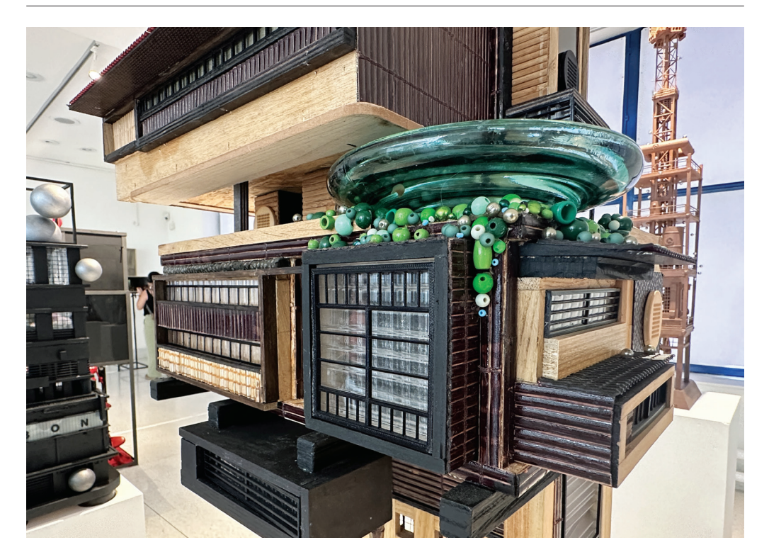
Fig. 8: Finland: Energy Towers by Kalle Nurminen. PQ 2023.

random, resulted in fantastical architectural behemoths, evoking partly completely realistic and partly fantastical buildings.