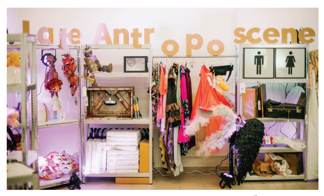
Fig. 3: Bulgarian Pavilion at PQ 2023.

someone's home or recycled into a beautiful piece of furniture or something else. What happens to them, when practically there is no theatre museum at a national level? There are only two theatre museums in Bulgaria - one of them is the museum of puppets at the National Puppet Theatre in Varna, and the other was opened in 2022 - a theatre museum at the Plovdiv Drama Theatre. Both institutions, however, encompass only the local theatrical facts. The lack of a network of theatre museums in the country provokes the question about the future of theatre artefacts, posed by the Bulgarian pavilion, which echoes particularly strongly here.