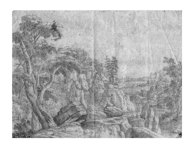
Fig. 5: Christian Johann Bendeler, Wood Landscape, chalk drawing, Staatliches Museum Schwerin, Kupferstichkabinett.