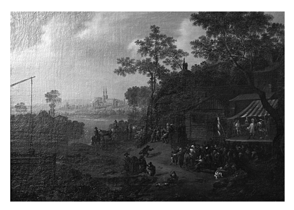
Fig. 1: Christian Johann Bendeler, Landscape with an Open-Air Theatre, 1720, oil, canvas, Städtische Museen Quedlinburg / Schlossmuseum.