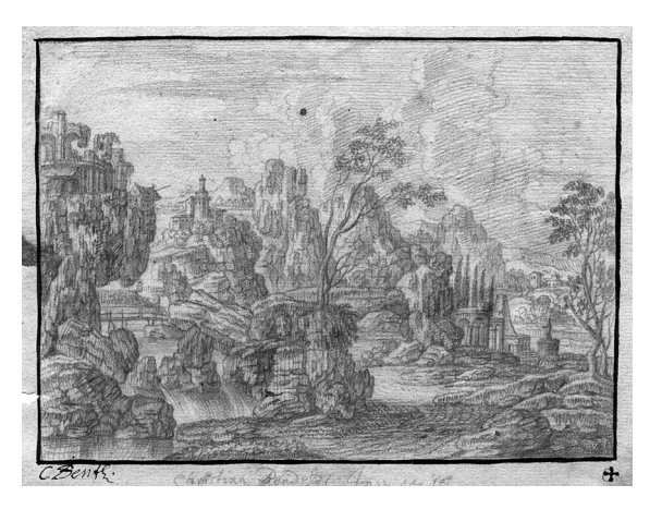
Fig. 6: Christian Johann Bendeler, Rocky Landscape with a Castle View, 1714, coloured pencil drawing, Staatliches Museum Schwerin, Kupferstichkabinett.