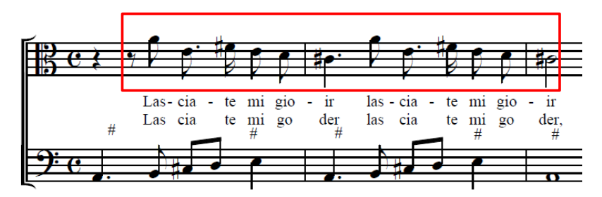
Sample 2 Aria of Giubilo

Schmelzer furthermore applies polyphonic entrances of voices in several ensembles, similarly to Antonio Draghi in some cases, and he alternates them with homophonic passages. Due to the absence of ensemble passages in Hercules und Onfale and a Particell of Die sieben Alter stimmen zusammen , it is not possible to find out if he also set passages with multiple voices similarly in German serenatas. The same procedure can be found in the instrumental ritornellos of Le veglie ossequiose . Those have five voices without distinction. Similarly to Draghi, Schmelzer employs a motif that quotes the introductory motif of the aria or a variant of it. After a polyphonic entrance of voices (which appears in several ritornellos), a homophonic part follows. At the end of the ritornello, the introductory motif of the aria recurs.