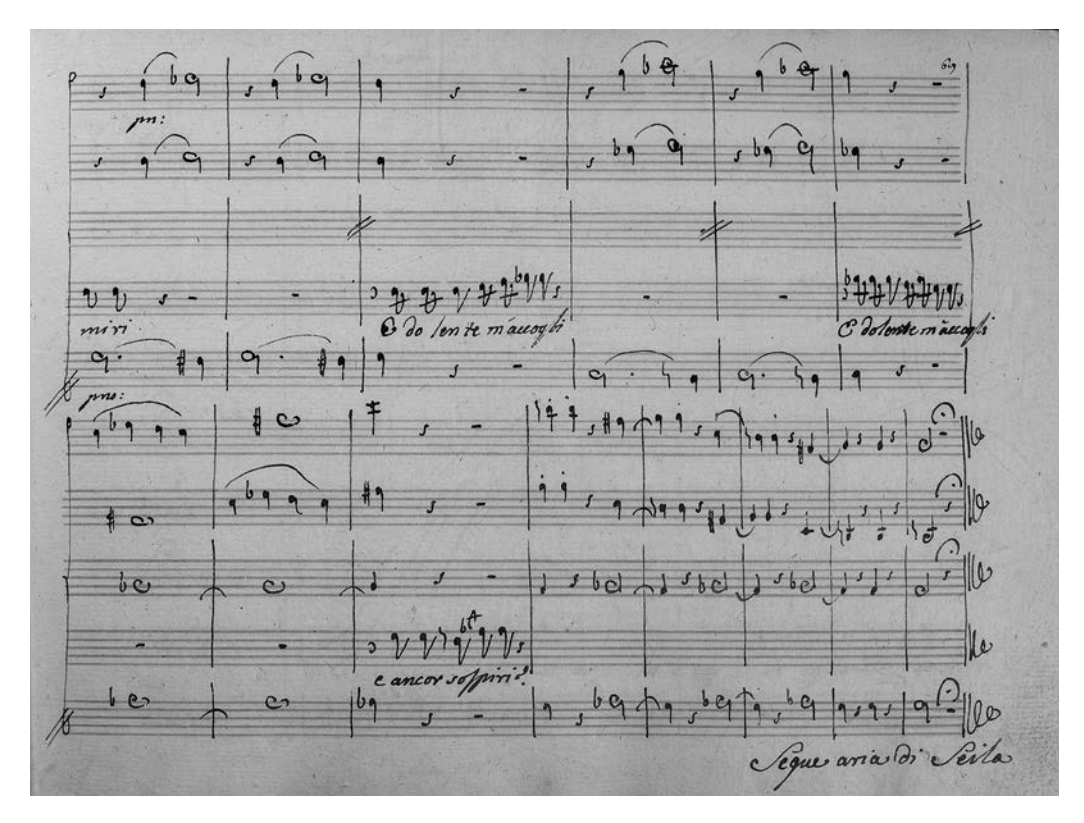
Ex. 1 Part 1, scene 3, Seila, Accompagnato "Ma tu non parli?", end.

and do you welcome me with sorrow, and do you still sigh?