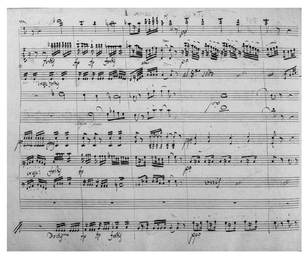
Ex. 3 Part 2, scene 1, Seila, Accompagnato: Instrumental introduction, p. 174.

The Cavata that follows is a prayer, sung in an expressive Adagio in C major with full orchestra and the addition of the English horn: