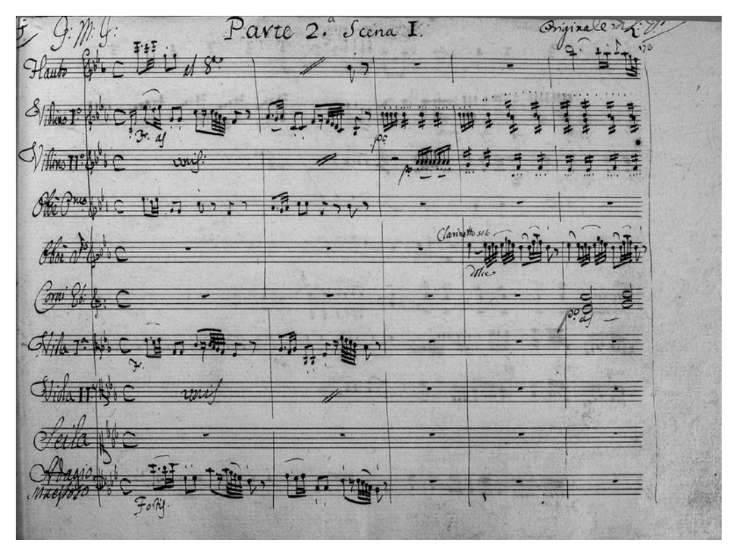
Ex. 2 Part 2, scene 1, Seila, Accompagnato: Instrumental introduction, p. 173.

To evoke the tension that agitates Seila, Gatti works extensively with instrumental figures and dynamic nuances, as is very clear from example 2 but especially from example 3: