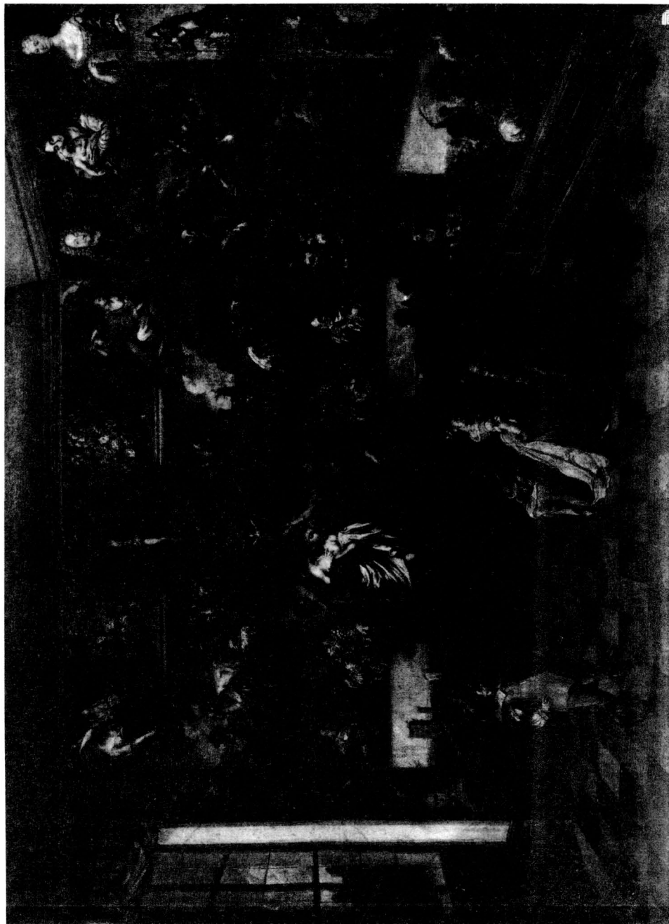
11. Anonymous (Czech ?) painter of the 2. quarter of 18th century, Paintings Gallery . Národní galérie v Praze.