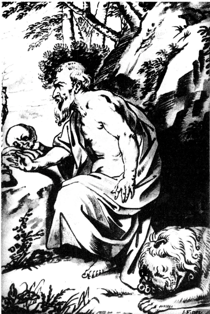
4. Jan La Fresnoy after Peter Paul Rubens, St. Hieronymus . Imagines Galeriae , Národní knihovna České republiky-oddělení rukopisů.