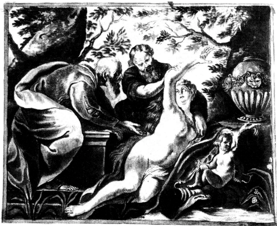
10. After Giulio Cesar Procaccini or Louis Finson, Susanna and the Elders . Národní galerie v Praze.