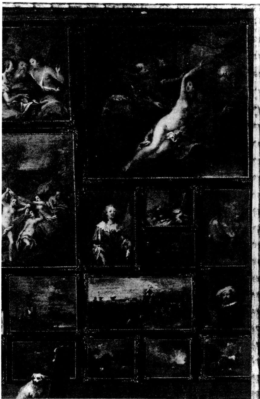
9. Norbert Grund, Paintings Gallery -detail. Augsburg, Städtische Kunstsammlungen — Deutsche Barockgalerie.