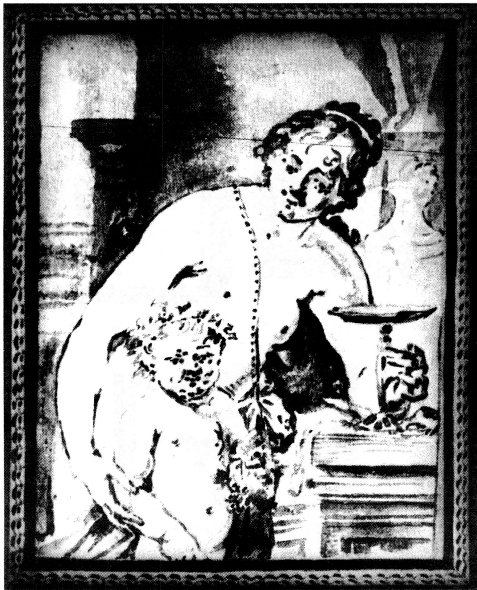
3. After Giuseppe Diamantini, Venus and Cupid . Imagines Galeriae , Národní knihovna České republiky-oddělení rukopisů.