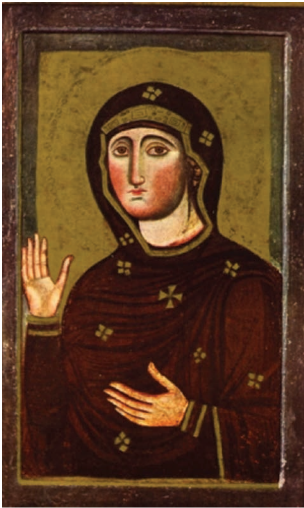
7 – Madonna Aracoeli , 11 th century. Church of S. Maria in Aracoeli, Rome