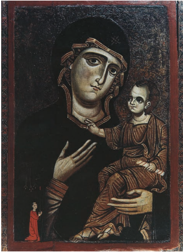
13 – Madonna della Madia of Monopoli, 80s of the 13 th century. Cathedral of Monopoli

consider the Brno panel a result of the intersection of the two traditions. It would therefore have to have been produced at a time when the intersection was not only possible, but in light of historical events, logical as well.