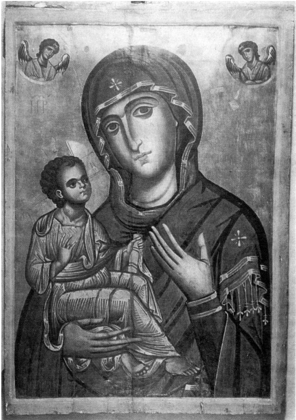
11 – Byzantine Master, Icon of Sinai , 13 th century. Monastery of St. Catherine, Sinai