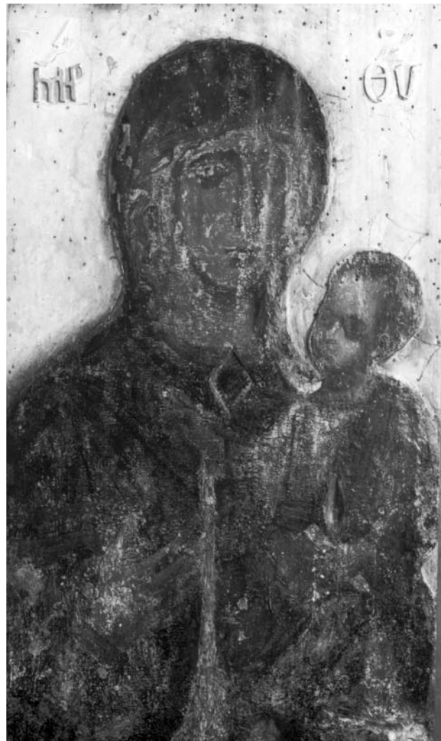
2 – The Icon of Old Brno – state before the restoration, second half of the 13 th century, Italian provenance. Church of the Assumption of the Virgin Mary in Old Brno, Brno