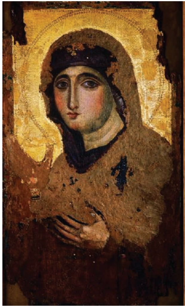
8 – Madonna S. Sisto , 6 th century. S. Maria del Rosario, Rome

a much closer stylistic relationship to the Italian icons mentioned above [fig. 2] than to the Prague icons.