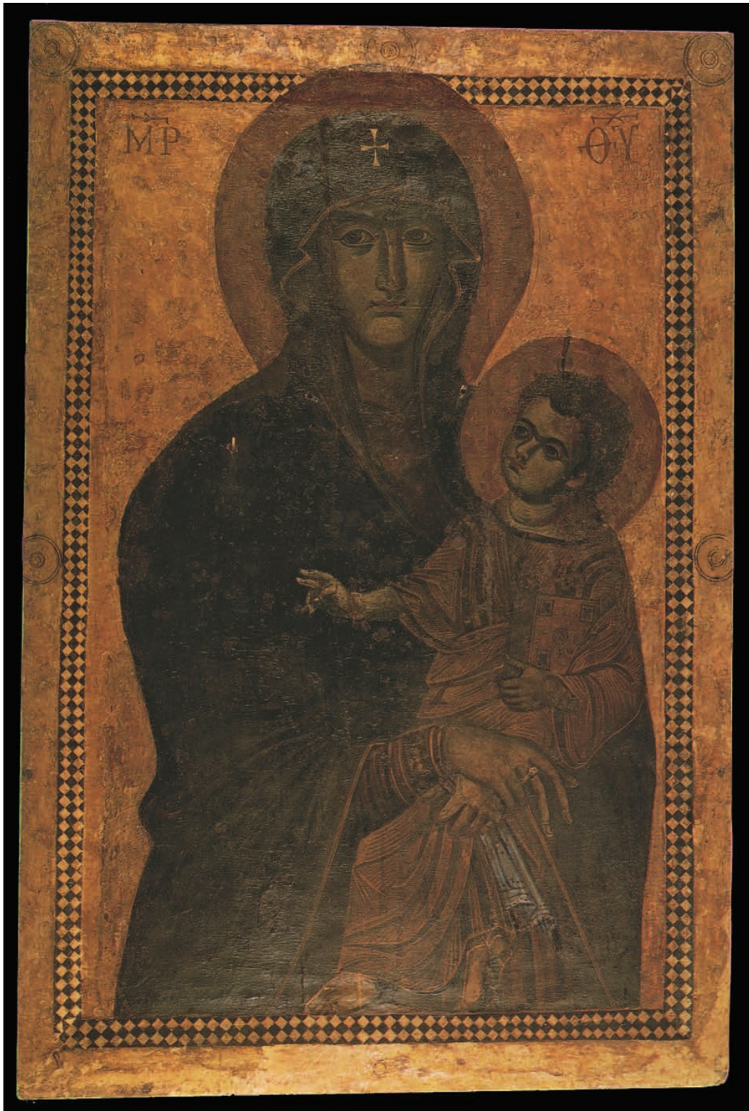
10 – Salus Populi Romani, 6 th (?) and 13 th century. S. Maria Maggiore, Rome