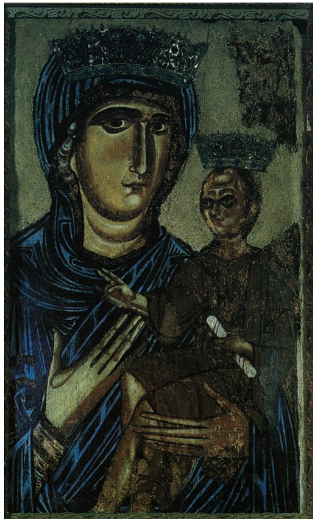
12 – Madonna della Fonte of Conversano , 1268–1269. Cathedral of Conversano

If we accept the possibility that we are dealing with a fusion of several elements – iconography and formal design based on venerated and widely copied Roman icons joined with elements characteristic of Eastern icons – we can