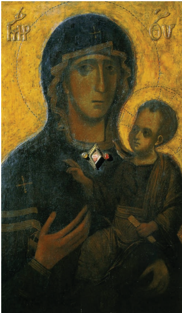
1 – The Icon of Old Brno – state after the restoration, second half of the 13 th century, Italian provenance. Church of the Assumption of the Virgin Mary in Old Brno, Brno