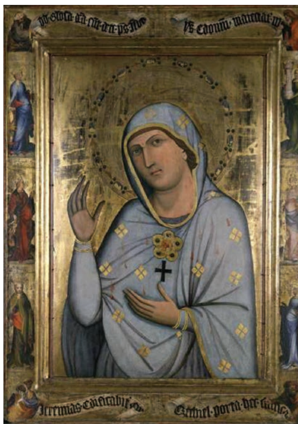
4 – Master of the Třeboň Altar, Madonna Aracoeli , 1385–1390. National Gallery in Prague