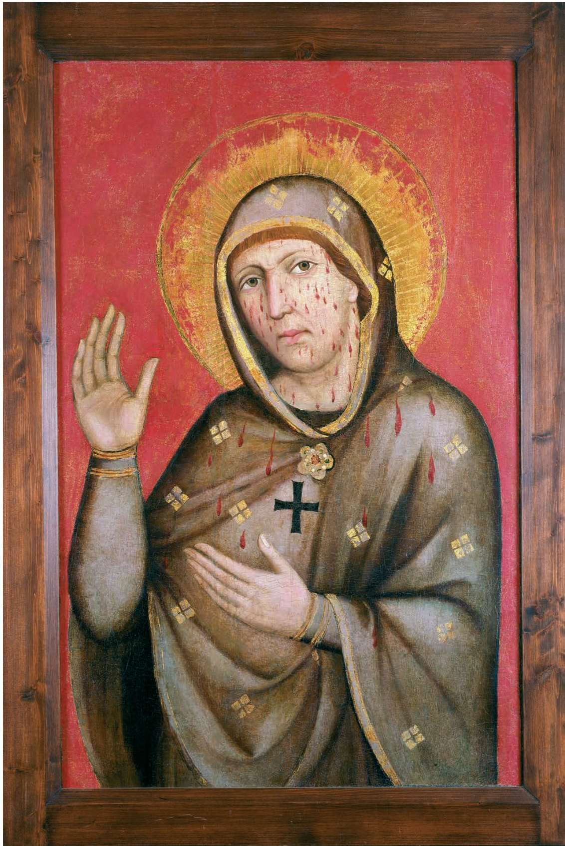
6 – Madonna Aracoeli, around 1360–1370. Metropolitan Chapter by St. Vitus in Prague, exhibited in the National Gallery in Prague