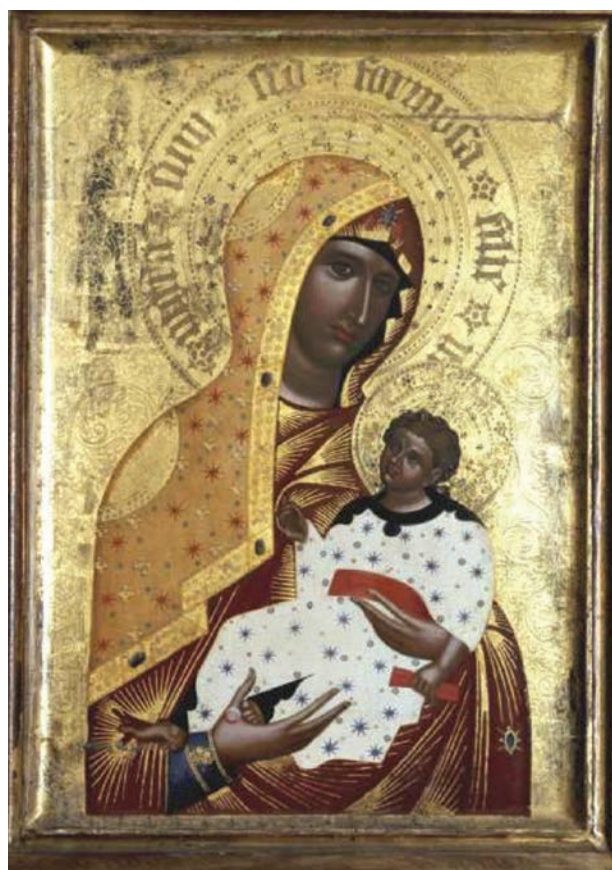
5 – Madonna of Březnice, 1396. National Gallery in Prague

Now we shall try to compare the subject of our study – the panel in Brno – with the panels at the National Gallery in Prague. Are there, in the Brno icon, similar means of expression to those found in the Luxembourg artists' panels? The relatively poor state of the Brno icon, whose original state is best studied in photos taken after newer layers were removed in 1945, only allows a formal analysis to a limited extent. Nevertheless, we are able to observe, at first glance,