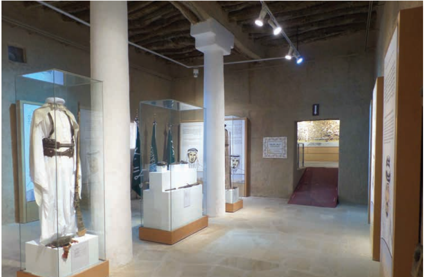
Fort Masmak Museum – The Pioneers

to work hard to regain both its regional position and its legitimacy among Saudi citizens.