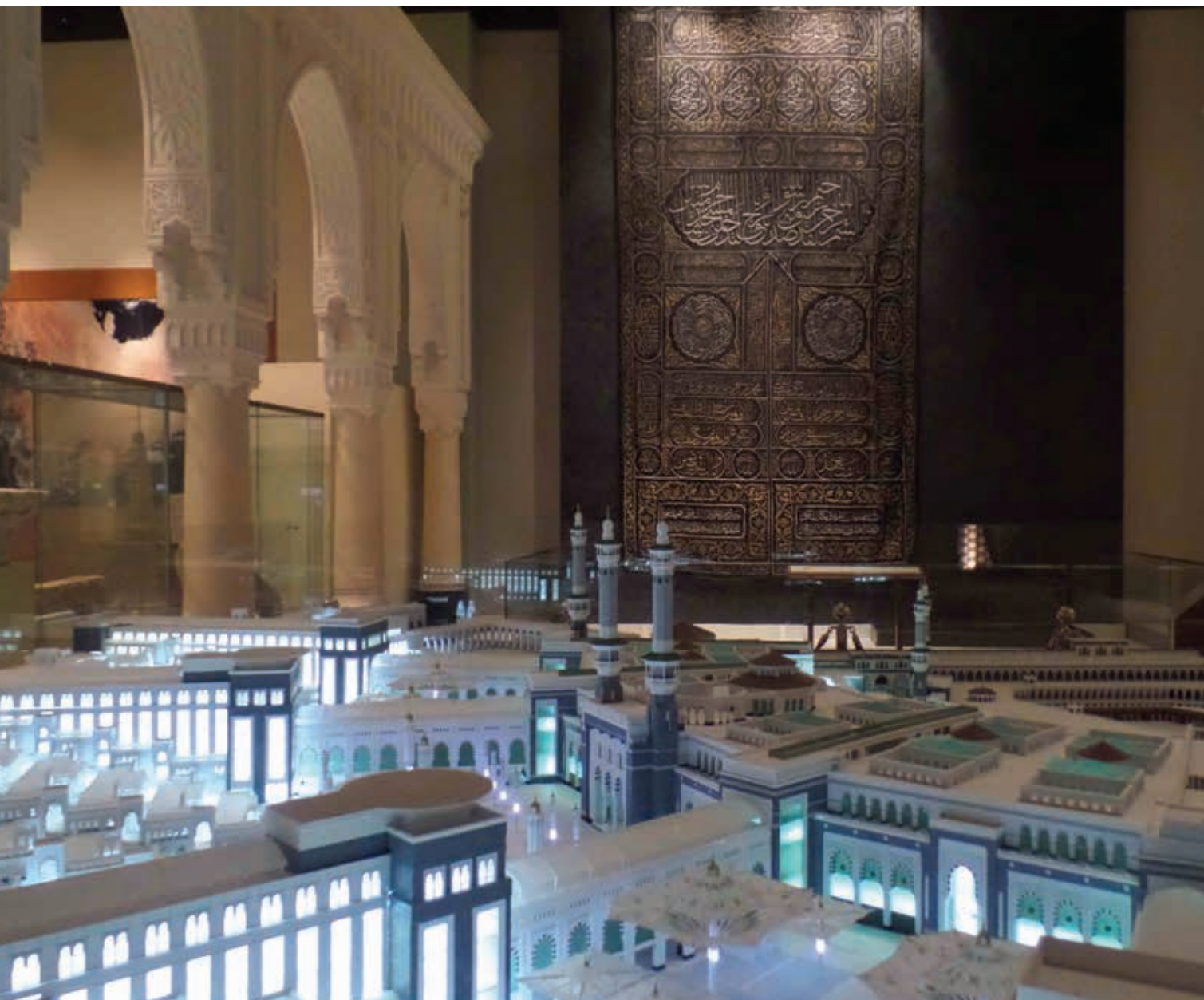
Riyadh National Museum – Holy Mecca Room

of participants 27 . The demonstrators who expected reforms and a fairer division of the power have been arrested and all demonstrations have been forbidden. In December 2011, King 'Abdullah and SCTA launched a National Campaign to Enhance the Cultural Dimension of the Kingdom in order to “seek to highlight the cultural dimension of the Kingdom which integrates well-known three dimensions; the Islamic dimension, political dimension and economic dimension”. Thus Saudi citizens have to realize “how it is important [to] being proud of [the heritage]