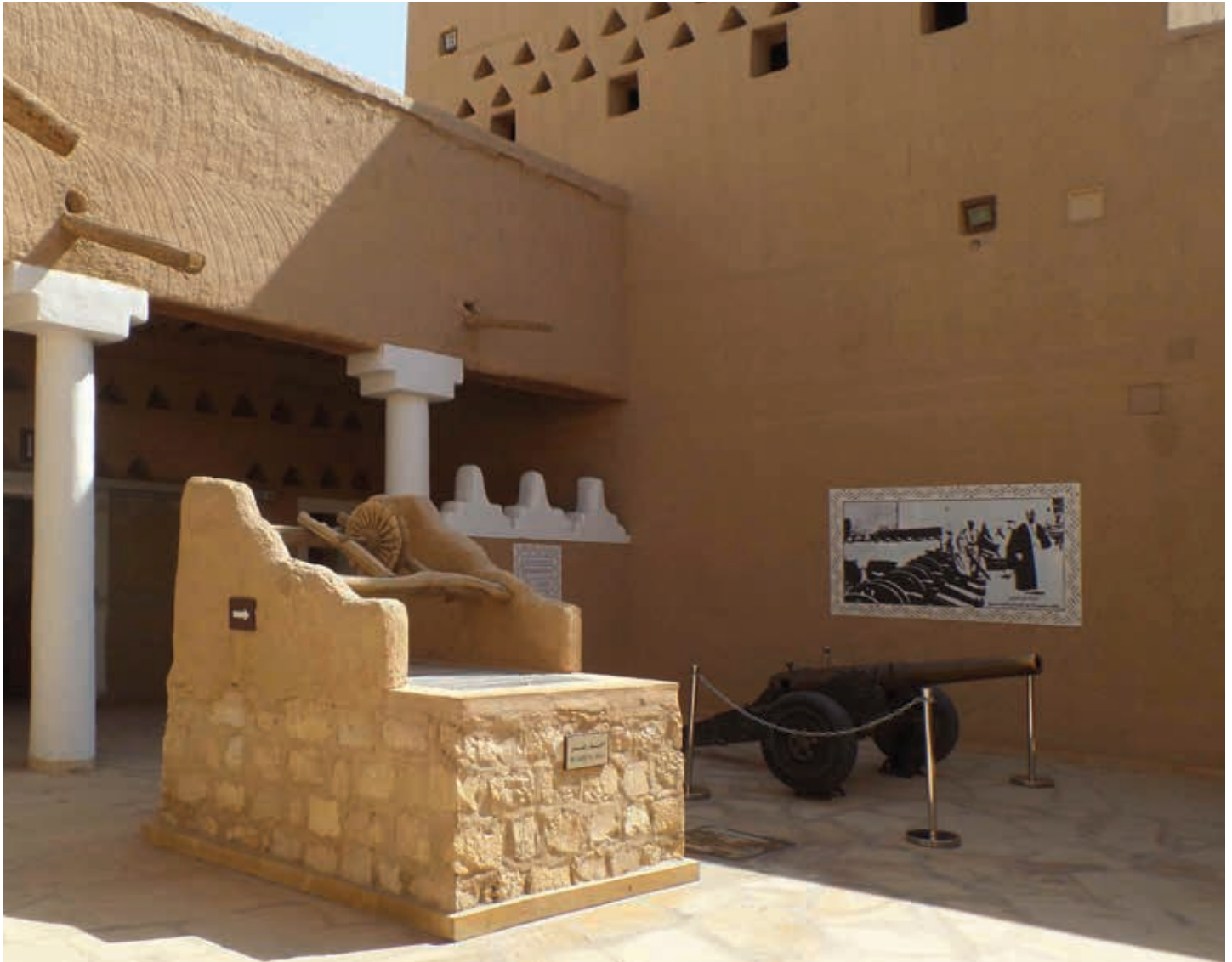
Fort Masmak Museum – Yard

National museum narratives are way subtler as they focus on one key component of Saudi national identity: Islam and the role of Allah in the existence of the Kingdom of Saudi Arabia 20 . Riyadh National Museum aims thus to present the story of Islam “as understood by Muslims 21 ” as part of the history of Saudi Arabia. In fact, the nearly 30 000 m 2 are divided into two wings: one telling the story of Arabia before the advent of Islam in the seventh century AD, and the other telling the story of Islamic Arabia until the death of King ‘Abd al-‘Aziz in 1953. The two wings are linked by a corridor shaped with a colourful frieze