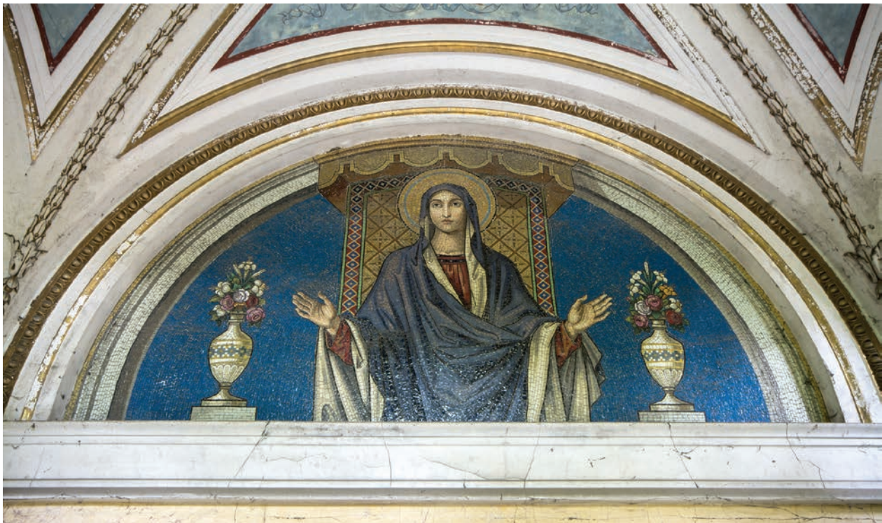
8 – The Madonna based on a design by František Sequens, 1882. Prague, Smíchov Cemetery, Roskoschny family tomb

Compared to other painting techniques, mosaics were considered a durable material: 'Mosaic does not perish as quickly as sgraffiti and does not fade like paintings; apart from temporal durability, it has the advantage of a strong colourful note, energetic where needed and radiant.' 36 It seemed ideal for decorating sepulchral places. In the second half of the nineteenth century, it was used in the decoration of cemeteries in Rome (Verano), Venice, and Florence, and, as the craft developed, in Vienna and Munich as well. In the conservative milieu of Central Europe, however, it represented an innovation that was in need of broader promotion. Compositions for tomb interiors, entrance tympana, the walls of arcade tomb chapels, or sepulchral stelae were not initially the main objective of Neuhauser's workshop. In the first decades, its advertisements focused on acquiring more monumental commissions (decorating churches, altars, and important secular buildings). Only with the decline of historicising architecture in the late nineteenth century did mosaicists also have to seek smaller commissions. While the companies continued to