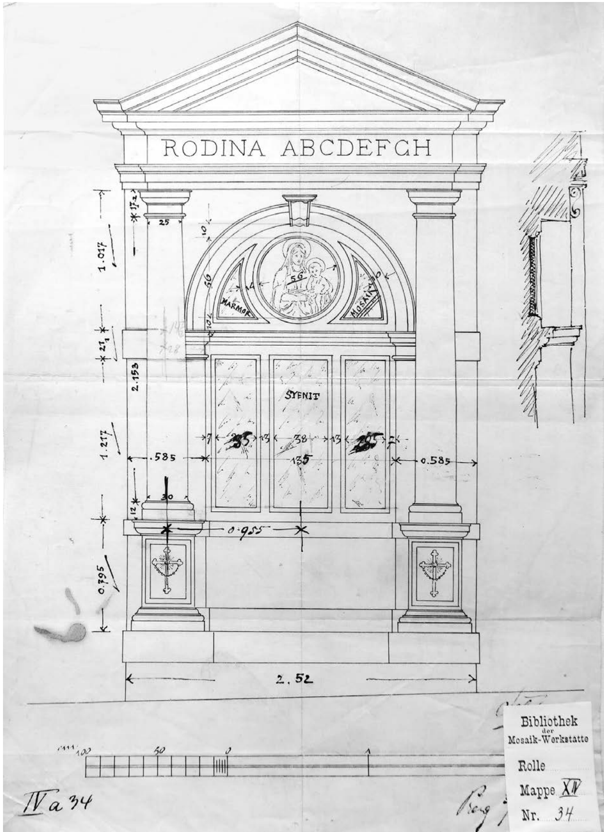
10 – Antonín Barvítius (?), design for a tomb with a scheme of the installation of a mosaic medallion featuring the Madonna, before 1900. Innsbruck, private corporate archive of Tiroler Glasmalerei