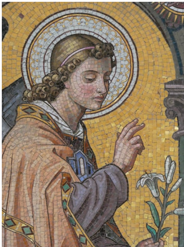
2 – Poetsch family tomb, detail of an angel's face from the Annunciation mosaic, 1884. Innsbruck, West Cemetery