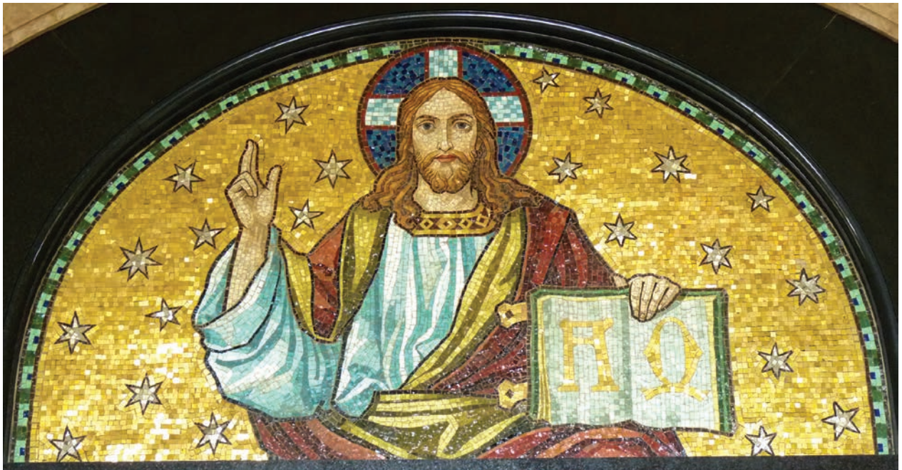
14 – Mosaic of Christ based on a design by Max Rainer, 1904. Prostějov Cemetery, Chmelarz family tomb