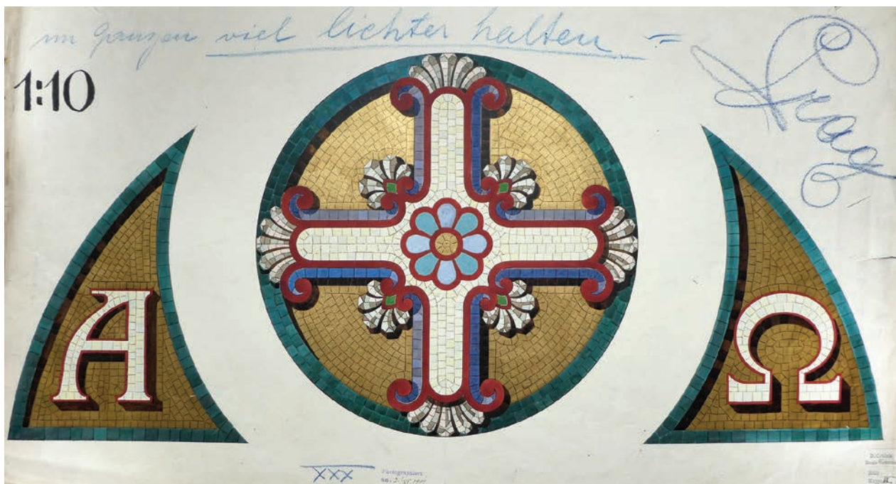
12 – Rudolf Margreiter, design for the mosaic panels on the marble extension of the Unger family tomb in Vyšehrad Cemetery in Prague, 1901. Innsbruck, private corporate archive of Tiroler Glasmalerei

The details about the system by which mosaic works were ordered by Czech clients from the Innsbruck-based mosaic workshop are rather varied. The communication with customers can be traced from the books of orders stored in the archive of what is today the Tiroler Glasmalerei company. 56 They contain records of completed commissions starting from the beginning of 1900. 57 The mosaic production is registered in separate files. Individual records include the name of the location the order was destined for and the object, a basic drawing of the shape and dimensions of the work, and a regesta of the communication between the client and