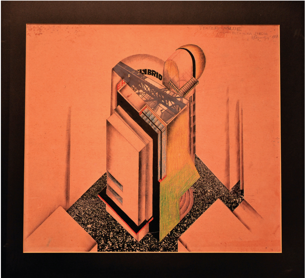
Fig. 2: August Černigoj. Teater - Masse , Architecture of Tank's Theatre, 1928. Published in Der Sturm . Iconotheque of SLOGI, Slovenian Theatre Institute, Ljubljana, Slovenia.

the content and the form into a new organic whole, which links him with the Russian and European Constructivism (see VREČKO 2015). In subsequent years, integrali (integrals), a style that might have been inspired by German Expressionism, followed the konsi .