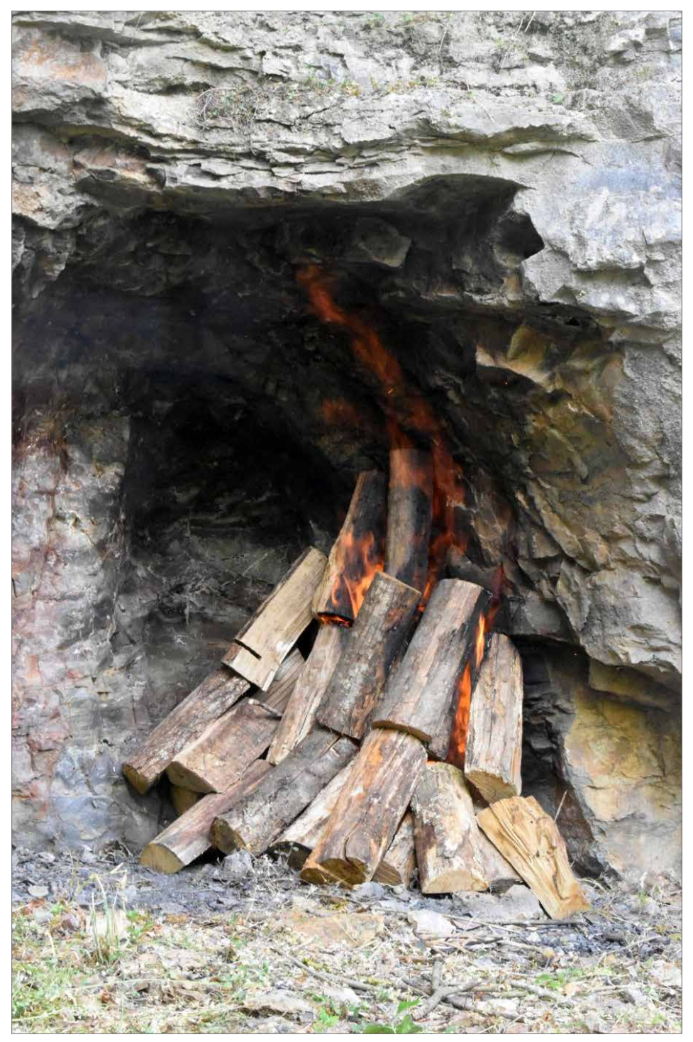
Figure 5. Pyre mounted on the working face. Obr. 5. Oheň na opracovávaném povrchu.