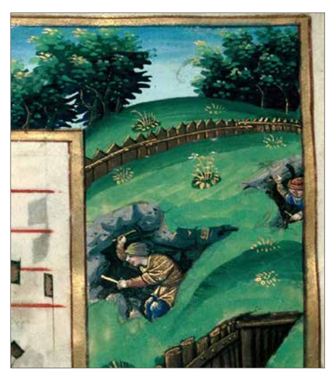
Figure 1. Illustration of mining with a hammer and a handle chisel. After Graduel de Saint-Dié 1510.

and handle chisel pair. The miner would place the handle chisel, on the wall and strike it with a hammer. This method is described in De Re Metallica (Agricola 1556) and is often depicted in ancient iconography (Kutnohorská iluminace 1490; Graduel de Saint-Dié 1510; La rouge myne de Sainct Nicolas 1525; Fig. 1). This pair of tools remains the most traditional symbol of the miners. Archaeological evidence of its use can be seen in the characteristic traces visible in certain galleries, or in the handle chisel found on mining sites such as Castel-Minier in Ariège, France (Méaudre, in press). It is rare to find miners' hammers due to the pragmatic reason that a miner would use a single hammer for a day's work, compared to a dozen handle chisel. In addition, the types of hammers used by the miners are similar to those used in other areas of metallurgical production. Schnitzler (1990) found some of these hammers in mines, providing insight into their size and weight. This initial mining method relied solely on human labour.