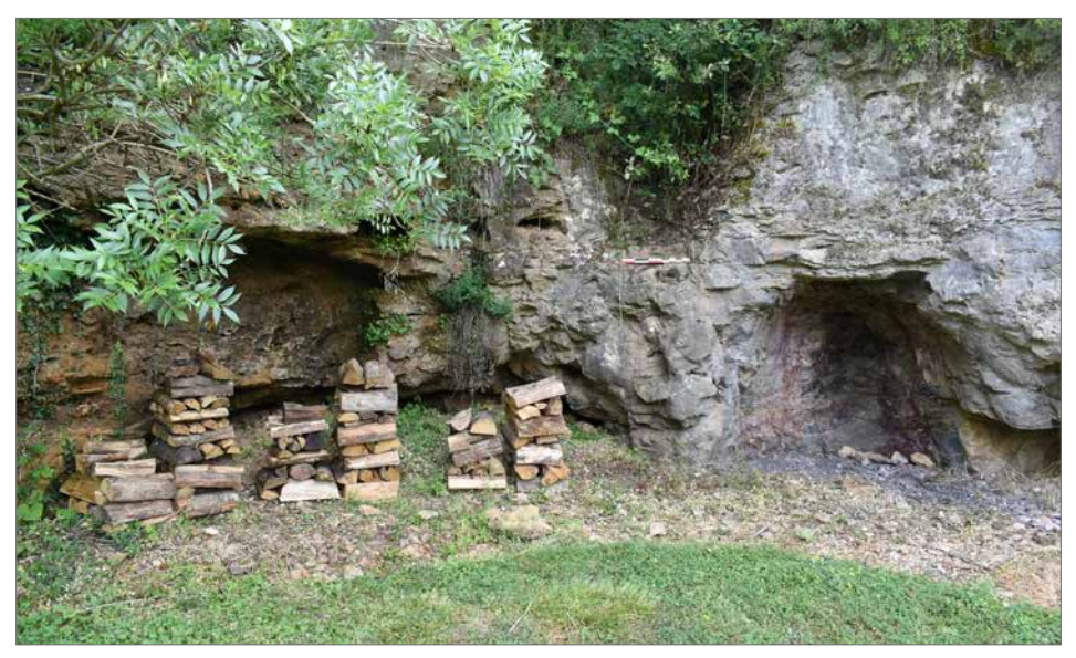
Figure 4. Experimental site for firesetting. Obr. 4. Experimentální místo pro rozdělávání ohně.

In this protocol there were two miner-experimenters. One carried out the first trial (Melle 1), and the second the other two trials (Melle 2 and Melle 3). Both were men who played sport and had some experience of mining at the Melle site. One of the experimenters, experimenter 1, carried out one of the fire tests and the two tool tests to ensure consistency in the measurements.