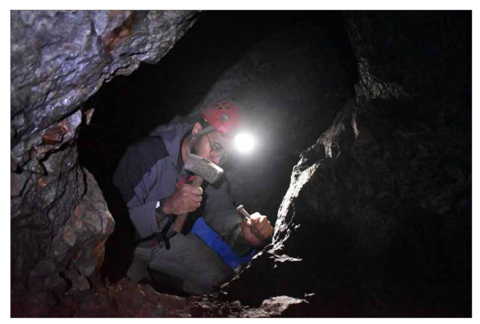
Figure 3. Mining with tools on a shale working face in the Lauqueille mine. Obr. 3. Těžba s použitím nástrojů na břidlicovém povrchu v dole Lauqueille.

in the Lauqueille mine. For the Lauqueille mine, the selected working face had the benefit of direct contact with a window, enabling the experimenter to capture a profile video. This allowed for measurements to be taken on rocks of varying hardnesses. Shale has a hardness of 3.5 on the Mohs scale, while quartzite has a hardness of 7.