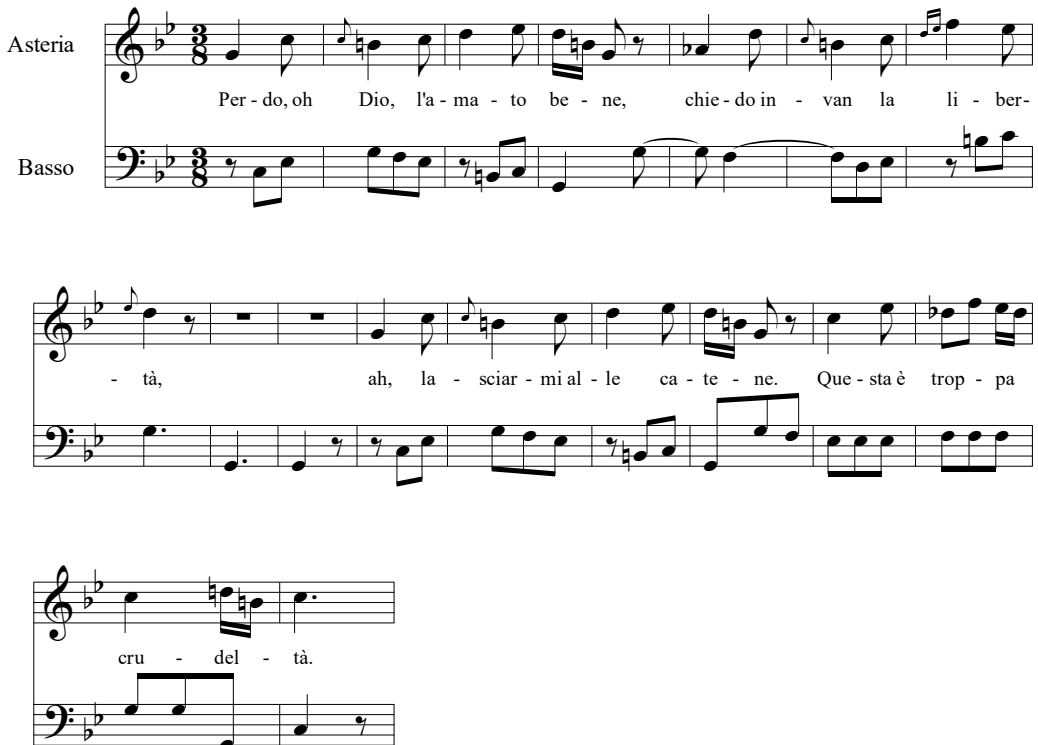
Fig. 2 Aria Asteria.

It is no coincidence that the quoted arioso stands out from the context of the entire intermezzo both in the language used and in the musical character of the arching melody. The opening eight bars are a direct quotation of the aria Perdo, oh Dio, l'amato bene from the opera Il Telemaco, ossia L'isola di Circe , composed by Christoph Willibald Gluck to a libretto written by Marco Coltellini: 24