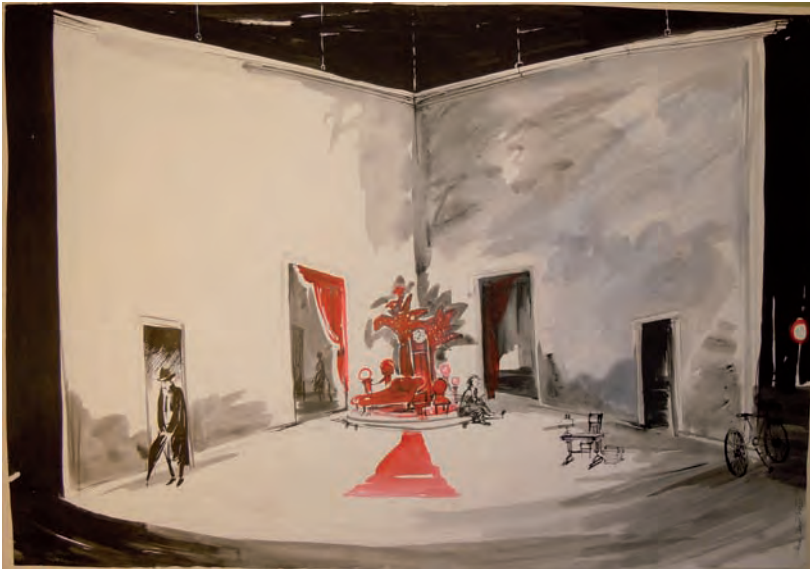
Jana Zbořilová. Scene Design for Žebrácká opera (The Beggar's Opera). Municipal Theatre in Most, 1994.

From the Collections of the Theatre Research Institute at OSU. No. SPEC.CZ.DES.78.