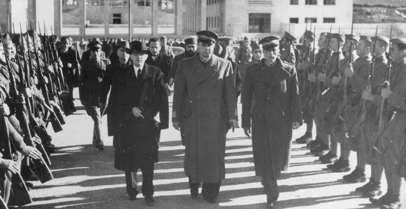
Enver Hoxha, Omer Nishani and Myslim Peza heading to the first meeting of Constituent Assembly, Tirana, January 10, 1946.