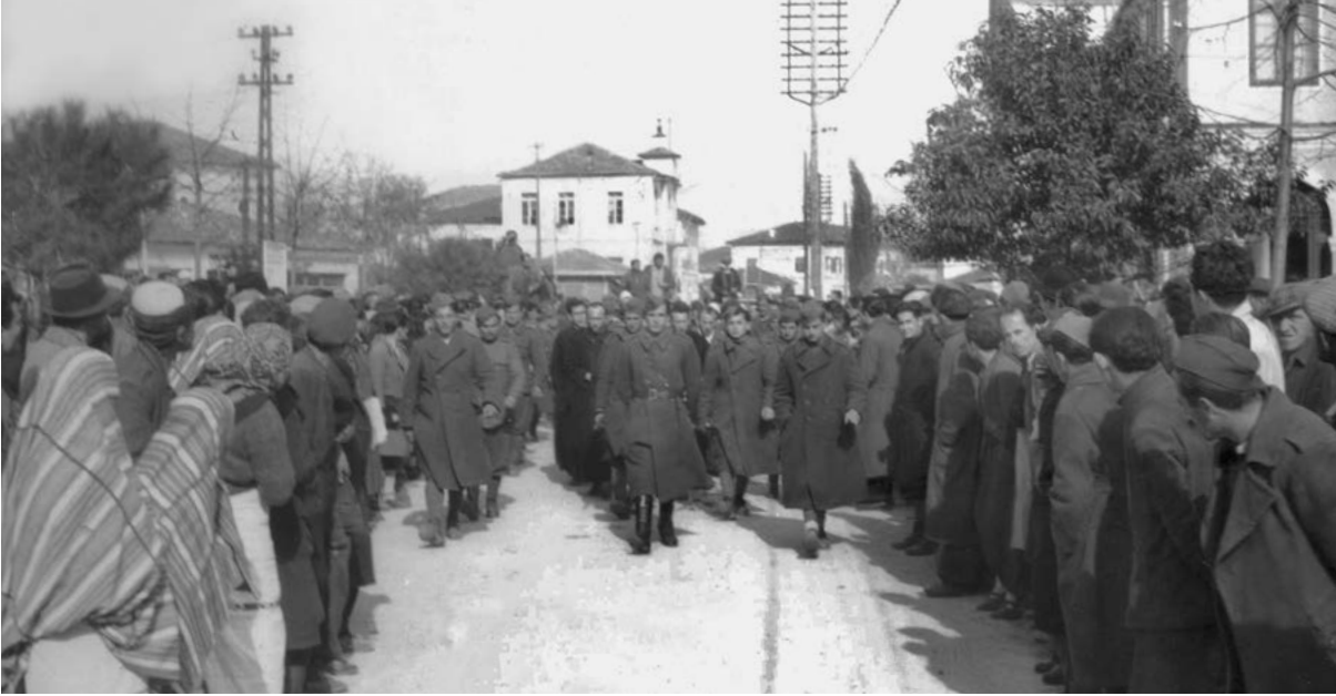
Catholic priests judged as members of the organization Bashkimi Shqiptar (Union of Albanians) heading the courtroom, Shkoder 1945.

they thus reconsidered their stance towards recognizing the Albanian government.