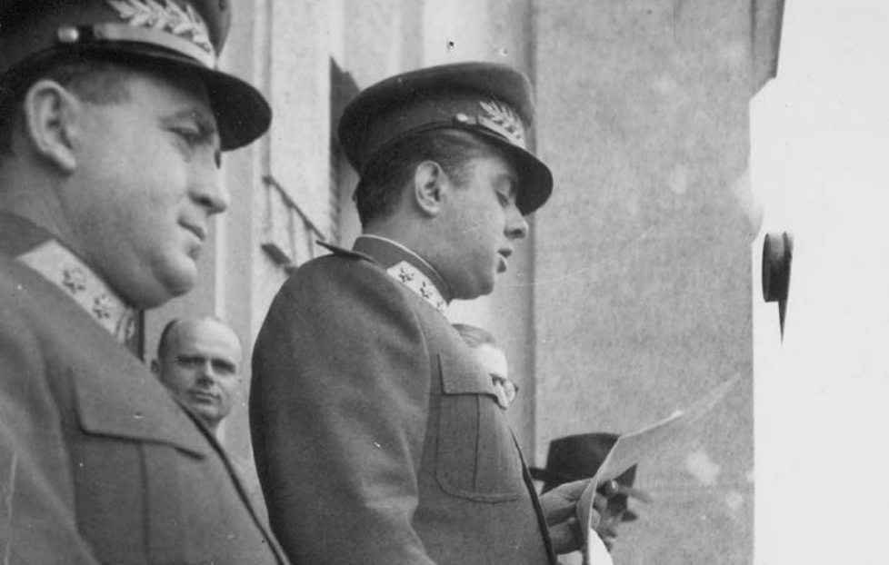
E. Hoxha and K. Xoxe addressing to the Albanian people during the election campaign, Tirane, November 1945.