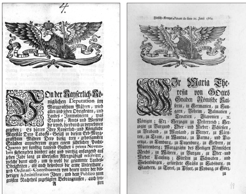
Fig. 3: Various diplomatic types (open decree, patent).