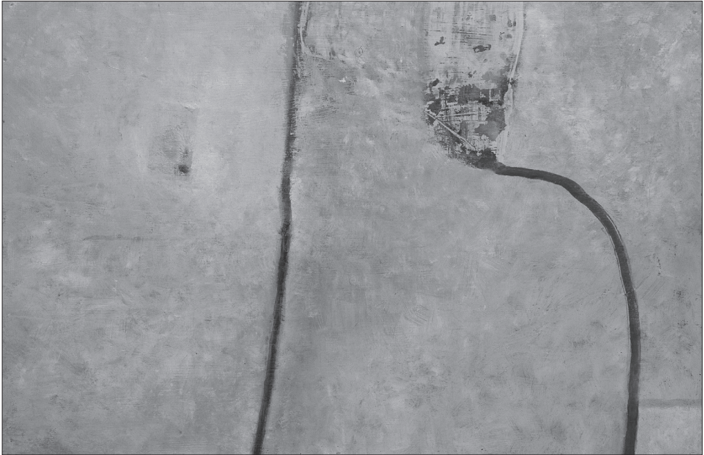
Fig. 1: Baroque Landscape (1997). © Jaroslav Malina.