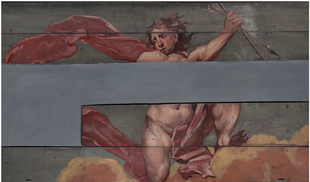
Fig. 4: Isaac Fuller, Resurrection (fragments), All Souls College, Oxford University.