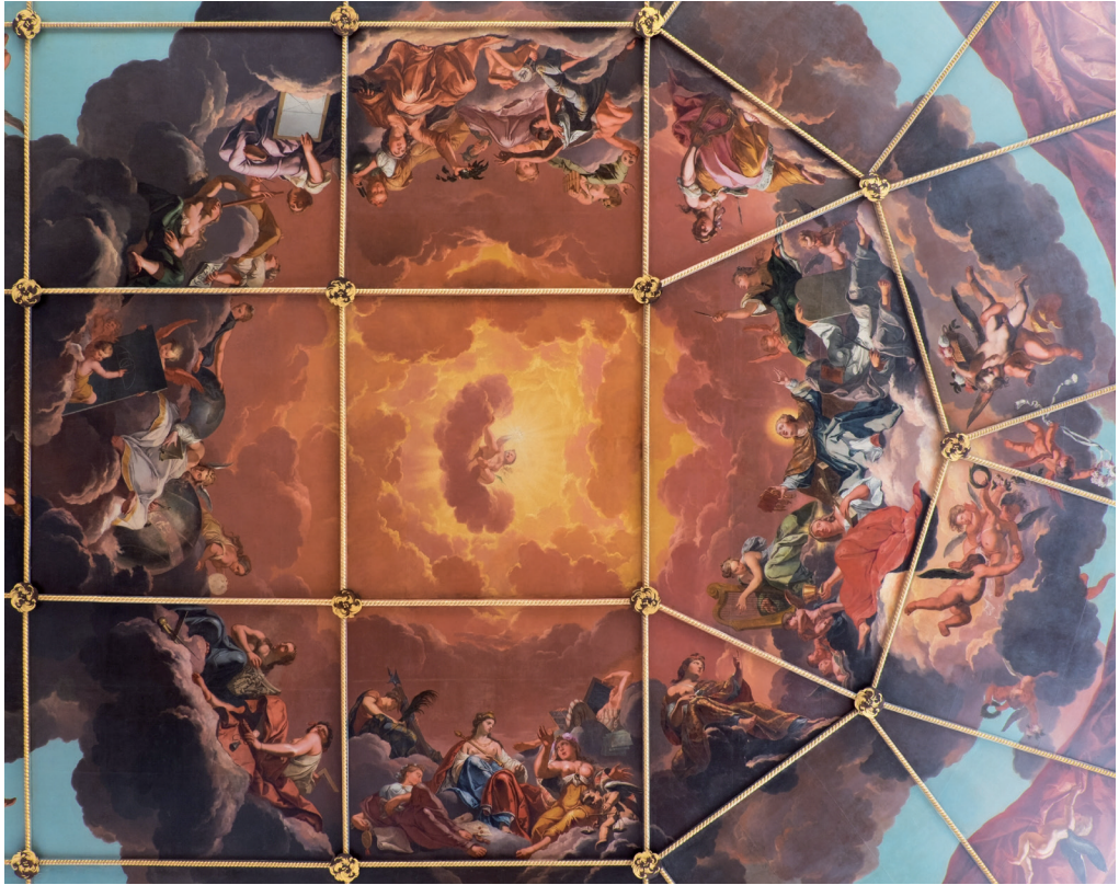
Fig. 6: Robert Streater, Ceiling fresco centrepiece (1670), Sheldonian Theatre, University of Oxford.

the three anti-virtues who are painted using a dramatic foreshortening which makes them appear to be tumbling from the sky. Indeed, surviving sketches of Jones's set design for Salmacida Spolia depict a figure of Discord who, as Geraghty shows, holds a clear visual correspondence with the figure of Streater's Envy (79).