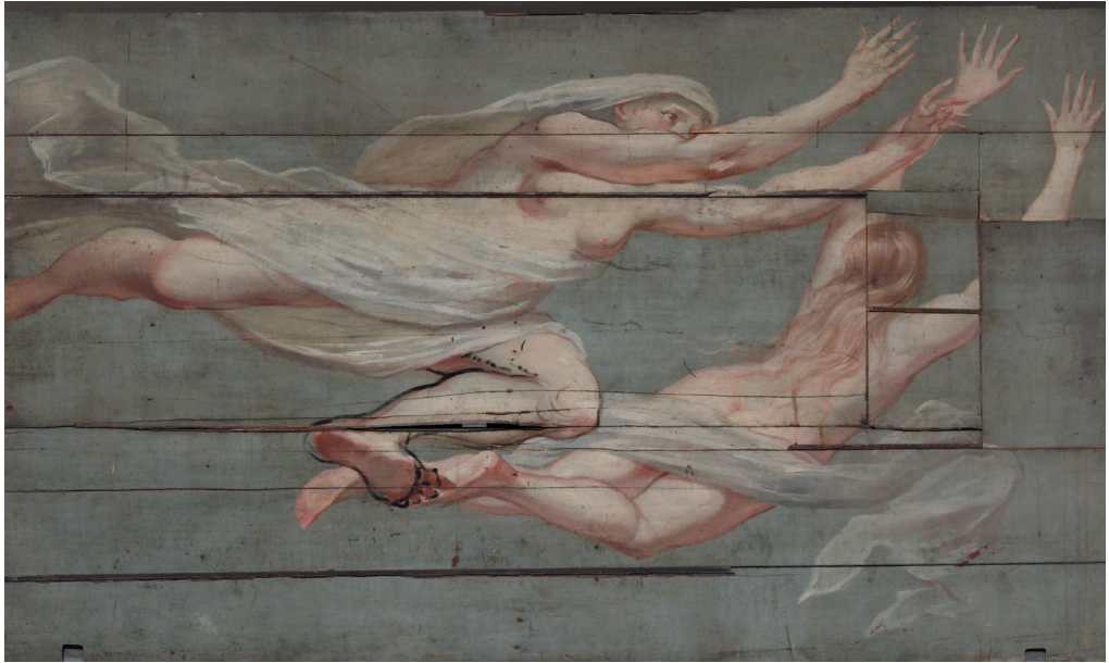
Fig. 3: Isaac Fuller, Resurrection (fragments), All Souls College, Oxford University.