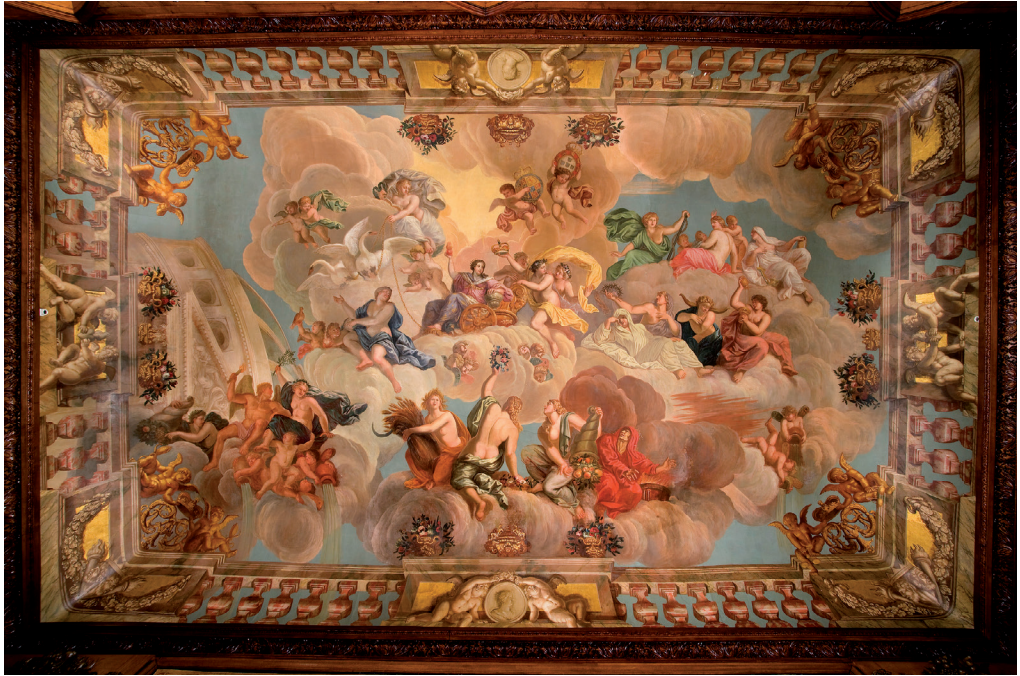
Fig. 1: Antonio Verrio, Catherine Braganza in a Chariot, 1675–c.1684, Queen's Audience Chamber, Windsor Castle, Royal Collection, RCIN 408426.