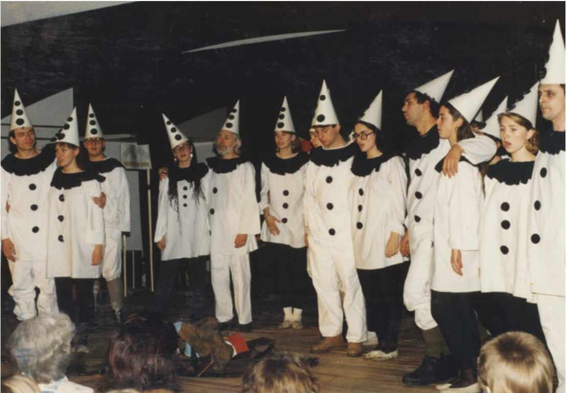
Oh! What a Lovely War , 1990.