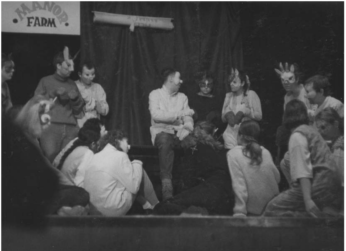
Animal Farm , 1989.