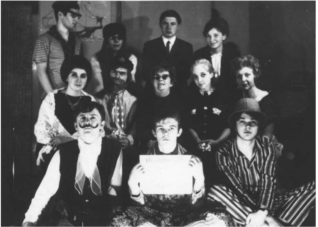
Heartbreak House , 1971.