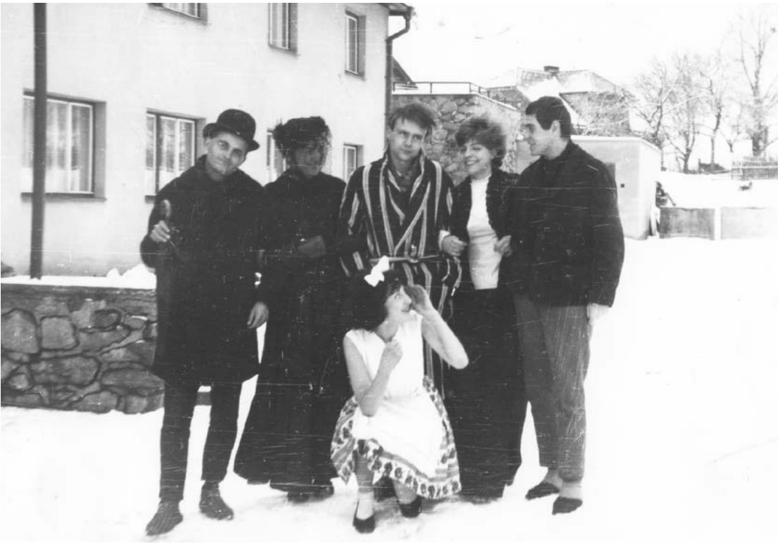
The cast of the first Gypsywood production, Dear Departed , at Cikháj, 1965.