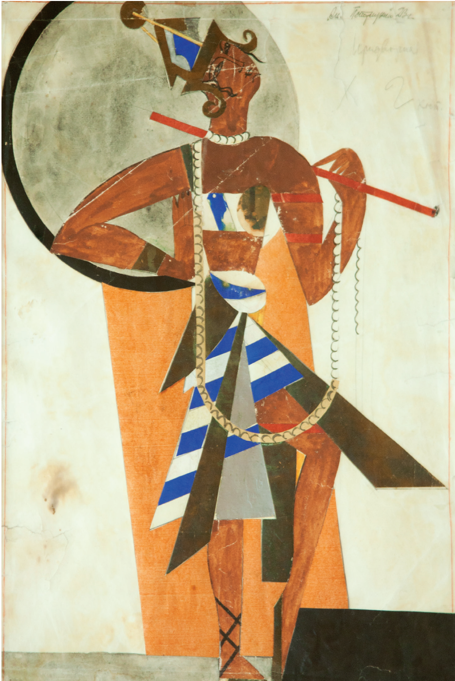
Fig. 2: Anatol Petrytsky. Costume design for the Nur and Anitra performance, 1923. National Culture, Arts, and Museum Complex 'Mystetskyi Arsenal', Kyiv, Ukraine.