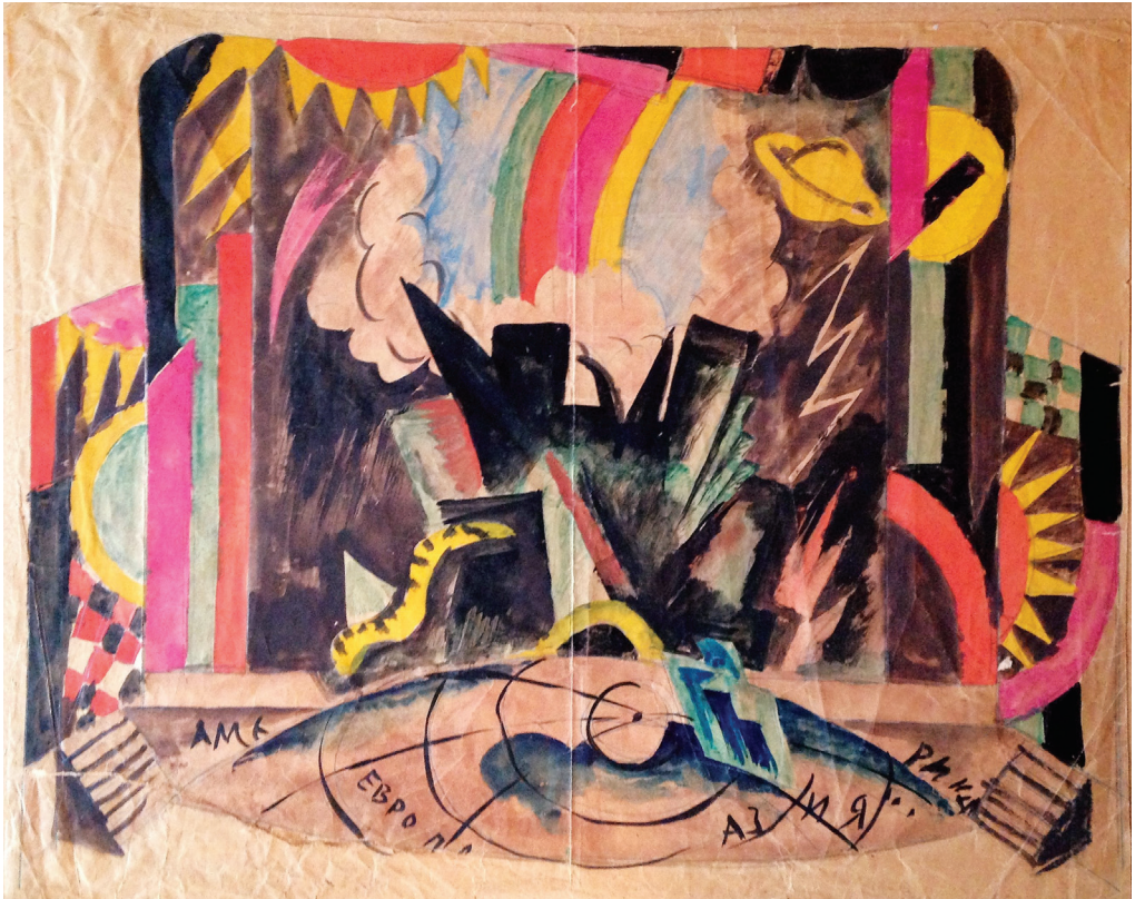
Fig. 5: Oleksandr Khvostenko-Khvostov. Set design sketch for the production of Mystery-Buff , 1921. Central State Museum-Archive of Literature and Art of Ukraine, Kyiv.

of the Jews against the Romans, led by Bar Kokhba, responded to the mood of the 1920s in Kyiv. According to Shor, the idea of abstract forms' dynamic plasticity corresponded to the aesthetics of the theatre of symbolist expressionism to the utmost. A stepped podium with different-in-height platforms unfolded along the entire width of the stage which went down, dissolving in the darkness of the stage. Wedge-like, pointed forms, on the contrary, came out and advanced from the blackness of spatial gaps, appearing as threatening, crushing, almost destroying with their mass. Their asymmetry and monochrome colour, combined with spots of red and blue or red and gold, intensified the tragedy of the production.