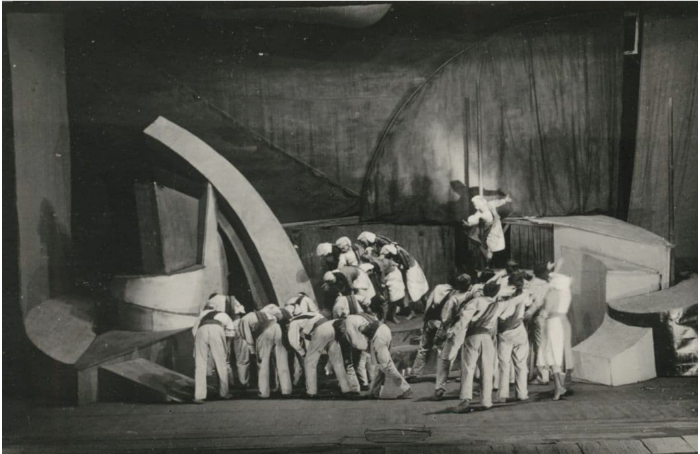
Fig. 4: Scene from the play Gas , 1923. Scenography by Vadym Meller. Museum of Theatre, Music, and Cinematic Art of Ukraine, Kyiv.

‘nakedness’ of structures and their subordination to functioning tasks, allowed Kovalenko (1992: 18) to define Vadym Meller’s design for Gas as the first pro-constructivist project in Ukrainian scenography in the early 1920s.