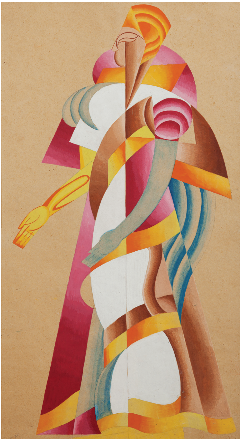
Fig. 1: Vadym Meller. Costume design for the Assyrian Dances , 1919. Museum of Theatre, Music, and Cinematic Art of Ukraine, Kyiv.