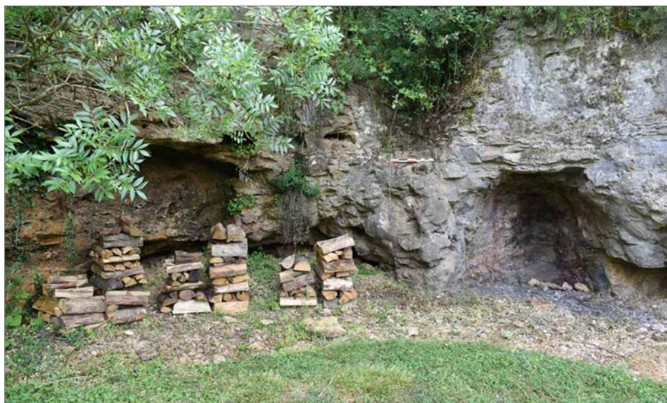
Figure 4. Experimental site for firesetting.

In this protocol there were two miner-experimenters. One carried out the first trial (Melle 1), and the second the other two trials (Melle 2 and Melle 3). Both were men who played sport and had some experience of mining at the Melle site. One of the experimenters, experimenter 1, carried out one of the fire tests and the two tool tests to ensure consistency in the measurements.