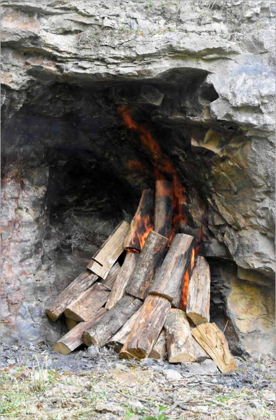
Figure 5. Pyre mounted on the working face.