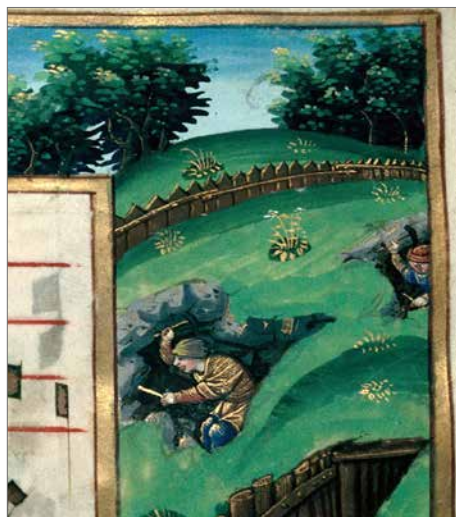
Figure 1. Illustration of mining with a hammer and a handle chisel. After Graduel de Saint-Dié 1510.

and handle chisel pair. The miner would place the handle chisel, on the wall and strike it with a hammer. This method is described in De Re Metallica (Agricola 1556) and is often depicted in ancient iconography (Kutnohorská iluminace 1490; Graduel de Saint-Dié 1510; La rouge myne de Saint Nicolas 1525; Fig. 1). This pair of tools remains the most traditional symbol of the miners. Archaeological evidence of its use can be seen in the characteristic traces visible in certain galleries, or in the handle chisel found on mining sites such as Castel-Minier in Ariège, France (Méaudre, in press). It is rare to find miners' hammers due to the pragmatic reason that a miner would use a single hammer for a day's work, compared to a dozen handle chisel. In addition, the types of hammers used by the miners are similar to those used in other areas of metallurgical production. Schnitzler (1990) found some of these hammers in mines, providing insight into their size and weight. This initial mining method relied solely on human labour.