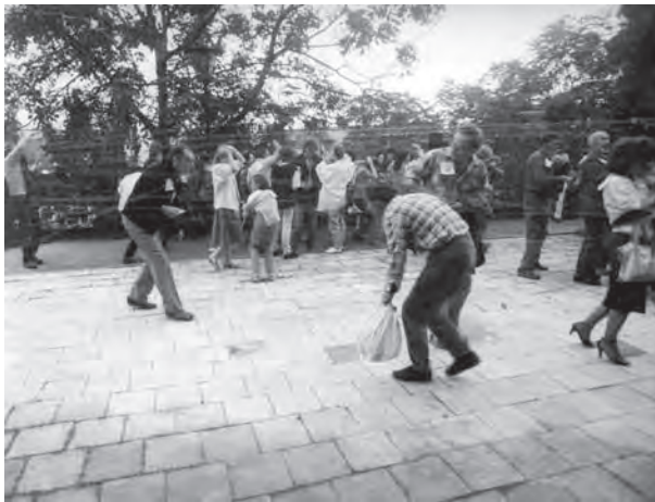
Street Performance Divadlo v pohybu III (Theatre in Movement III) of the Theatre Goose on a String on the Terraces of the Capuchin Gardens near St Peter and Paul's Cathedral in Brno (1987). Archive of the CED (Centre for Experimental Theatre), Brno.

Caravane concluded its tour. Václav Havel observed that when MIR Caravane stopped in Prague at the beginning of July 1989 it was in the form of a rehearsal for the non-violent spirit of the Czechoslovakian 'Velvet Revolution'.