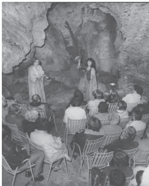
A Performance of Antonín Přidal's Pěnkava s loutnou in the Zbrašov Aragonite Caves (1983). From the Collection of the Documentation Centre of Performing Arts, Faculty of Arts, Palacký University, Olomouc.

into the biggest 'dome' (The Marble Cave), where they had to find themselves an appropriate place to stand, sit or lean – adjusting to the cold and uncomfortable rocky stumps. Besides expectation, the dominant emotion was loneliness in the vast space. Humbleness enforced by the cave hall was reflected in the audience's mood. Time before the start of the performance passed in silence, in spectators' whispered comments, in their looking for the most appropriate niche in which to stand, or a flatter spot on which to perch. Another production of the Studio Forum in Zbrašov Aragonite Caves was Antonín Přidal's balladic play Pěnkava s loutnou (Chaffinch with a Lute) in 1983. The performance for three actresses was built as a medieval dispute with fate and death unfolding the resonating theme of art and its liberating power, undoubtedly supported by the authentically archetypal, semantically concentrated irregular space.