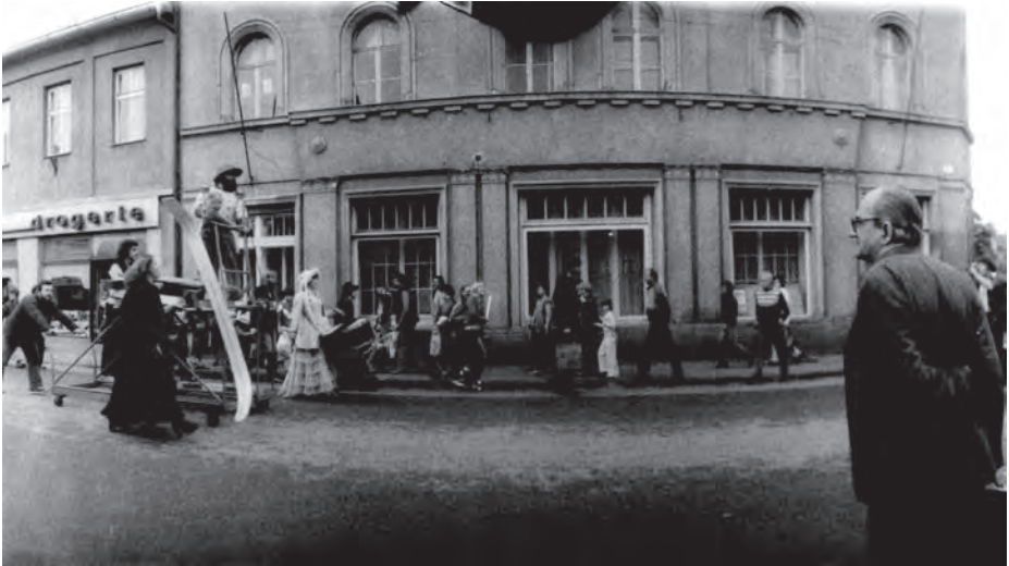
A Street Performance of HaDivadlo in Prostějov (1983).