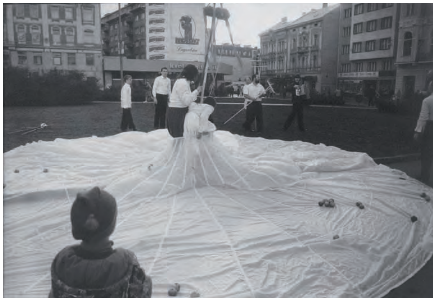
Street Performance Bílé sny (White Dreams) of the White Theatre in Ostrava (1984).

in the former Masaryk Square, and in other cities. Another open-air project by the White Theatre was Máj (May, 1985), based on the famous poem of 1836 by K. H. Mácha, performed on the bank and in the waters of the pond in Klímkovice park by Ostrava (NĚMEČKOVÁ 2007: 36). The typical trait of the White Theatre performances has always been a form of theatrical event associated with examining various possibilities of the theatrical encounter and so-called ‘public space’, where the audience together with the performers turn into authentic participants in an imaginative event.