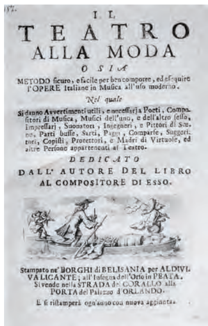
The Title Page of Benedetto Marcello's Treatise Il Teatro alla Moda (Venice, c.1720). Wienbibliothek im Rathaus, Vienna. Sign. A 44971.

and they have no need for light either, because they know their parts by heart. The ideological justification for the practices here described is to be found in the high measure of stylisation in Baroque acting, in which characters' emotions and even individual words were visualised by a set system of postures and gestures. For such an acting style, based predominantly on the declamation of lines, scenography represented a certain desirable decorative framework; in essence, however, it was not indispensable. Due to the perspective painting of the decorations, it was possible to act only in the front of the podium, and the more distant parts of the stage could not be used for acting, but simply as a background for tableaux vivants . With a view to this practice it becomes more acceptable that a collection of about ten archetypal decorative sets was perceived as fully sufficient for any production requirements of the operatic repertoire.