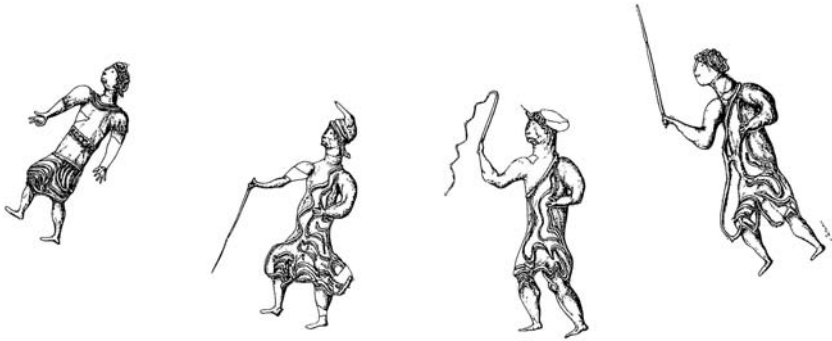
Fig. 4 The Procession of the Sun-Runner, Mainz Vessel