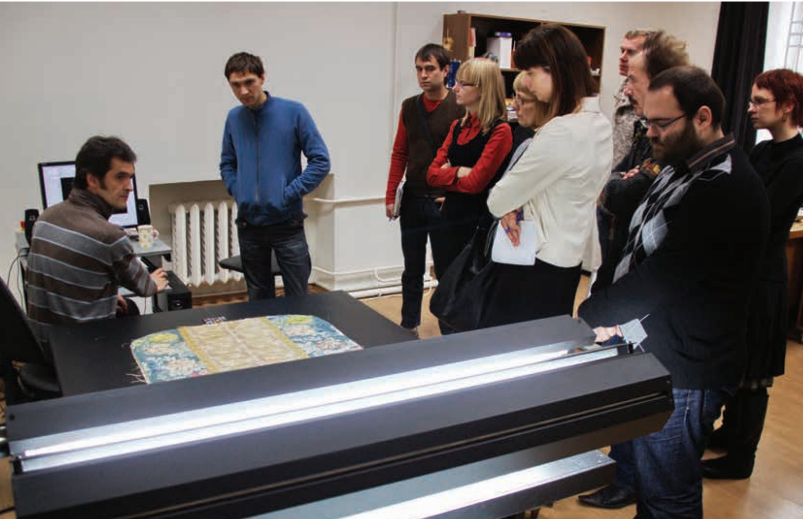
Fig.1: The only one having such power and scanning range in Lithuania, and few years ago in all Baltic states – wide range Cruse museum scanner at work in Lithuanian Art Museum LIMIS centre.

sphere 9 . Digital computing machines created in Soviet Lithuania were used in exact sciences, medicine, and economic needs, it did not reach the culture due to ideological and technical reasons.