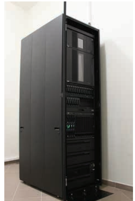
Fig.2: „Heart“ of LIMIS – Rack type box, which contains service station of LIMIS system in Lithuanian Art Museum LIMIS centre. The service station includes 4 Blade type servers, data storage, reserve copying device and source of continuous power supply.

However, new media application in memory institutions, historically, was unequal in different countries of the current European Union. „Iron Curtain“ was one of the reasons, which led to the technological lag of the Soviet Eastern Block comparing with Western countries. Significant ICT inventions, beginning with the first digital calculating machine ENIAC ending with a personal computer and the Internet were invented in the United States 6 , and not in the communist Soviet Union or its satellite countries. Analogical ten-