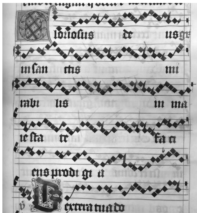
Fig. 3. AMB, V 2, Gradual no. 1, f. 227r – example of melisma shortening.