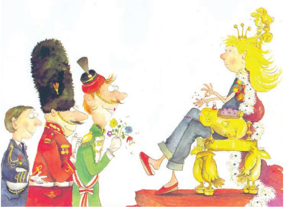
Figure 2. Princess Smartypants and her suitors

which shows the King and the Queen urging her to find a husband. This would be normal if it were not because Smartypants is wearing her overalls and Wellington boots.