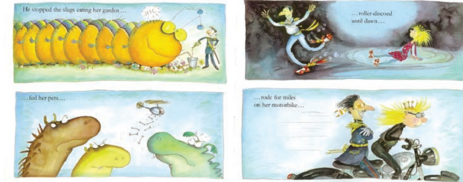
Figure 4. Prince Swashbuckle's resolution

has also to be made to a series of deviations from what is expected on the basis of our generic and world knowledge.