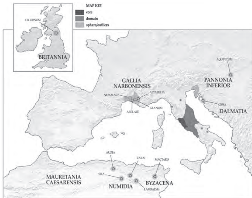
Fig. 4. Topography of the Bona Dea cult according to Meinig's model of dynamic cultural regions: Euro-Mediterranean region. 149

attention, 147 while it might also imply a change in the diffusion pattern. Therefore, the Gallia Narbonensis , along with the North-Eastern Italic and Dalmatian clusters (see fig. 4), are identified as the “sphere”, i.e., the peripheral landing of the cult in “zones of outer influence” 148 where it formed circumscribed pockets of a Roman cultural legacy.