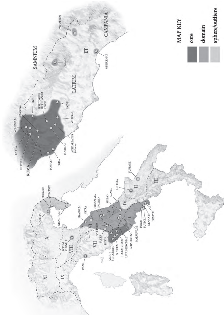
Fig. 3. Topography of the Bona Dea cult according to Meinig's model of dynamic cultural regions: Italic peninsula. 141