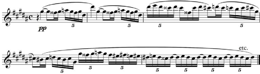
Ex. 4 Piccolo passaggi in seventh statement.

tremolo a perfect fourth doubled in three octaves and chromatically descending over the span of the whole bass statement; a “thick” passus duriusculus leading directly to the following statement of the bass theme.