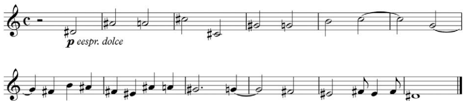
Ex. 3 French horn melody in sixth statement.

The seventh statement introduces new material as well. At the focal core the piccolo plays an ornamental melody consisting mainly of turns or gruppettos around the tonic, dominant, and occasionally subdominant notes of G sharp minor in fast quintuplets. Towards the end of the statement each last quintuplet becomes tied to the first of the next quintuplet group. As a consequence, the rhythm becomes vague and very much detached from that of the overall texture. Asynchronization is relocated from the layer level to that of rhythm, leading to further alienation between the layers. In the farther fringe, filling the register between the basses and the piccolo, the violins and violas play