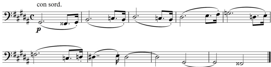
Ex. 2 Passacaglia bass theme.

From this note starts the slow unfolding of the Passacaglia’s bass theme with its gradually fading retentions and fulfilled or unfulfilled protentions . The theme builds up steadily rising within the ambit of a diminished octave, which is clearly perceived as we reach the higher G natural (which is in itself an unfulfilled protention in relation to the expected G sharp!), and then descending through a sequence towards the dominant of G sharp, leaping down a perfect fifth to the tonic followed by the leading-note F double sharp. The overall clarity of the theme’s structure makes it easily perceptible as a unity. There are, however, three aspects of it that need to be carefully examined: that of tonality, of rhythm, and of orchestration. As the following description will show, there is a dialectical play with regard to expectations, i.e. protentions, that make it rather unusual and, one may say, akoumenologically interesting.