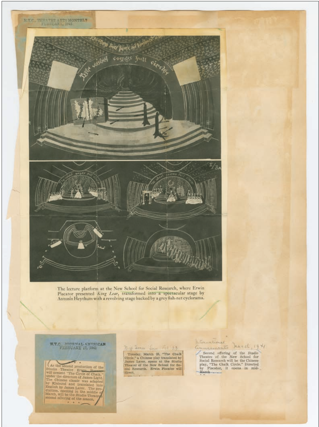
Fig. 2: Sketches documenting the scenographic development of the production King Lear , in: New York City, Theatre Arts Monthly, February 1942 (New School Publicity Office records. The New School Archives and Special Collection, The New School, New York, NY ).