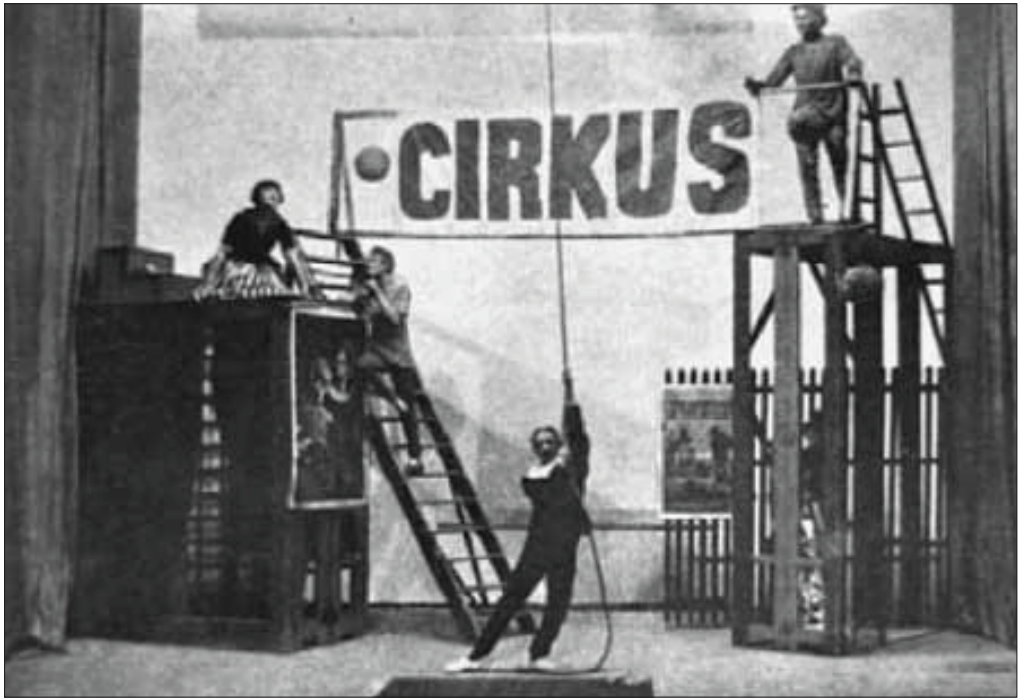
Fig. 6: Cirkus Dandin, Osvozené divadlo, 1925.

Thereafter, under changing lights, before porch blinds carried in by supers, with much running up and down the revolving steps, and with many entrances from the aisles, Shakespeare's tragedy runs – in cut form – a more expected course. Yet while so doing, the resulting 'Lear' fares little better than the old king does at the hands of Regan [...] And the others (including the army of twelve supers who wear trench helmets which have been silvered) are not much better. If this production at the New School is 'King Lear' then a gold-fish bowl is the ocean during an equinoctial storm. No wonder, when at eleven-forty or thereabouts the old king had finally breathed his last, some of us felt like applauding Kent as he said of Lear: Vex not his ghost: O, let him pass! he hates him much. That would upon the rack of this tough world. Stretch him out longer. (BROWN 1940)