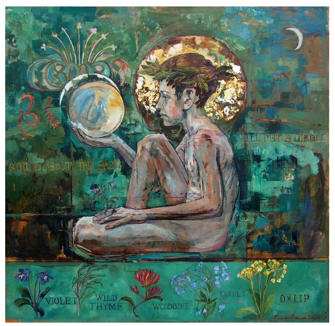
Puck & the World by Olivia Lomenech Gill

do that. I think sometimes using folktales and stories and myth can be a good way to do that. Also, illustrating books is a great way to work, it is more democratic too.