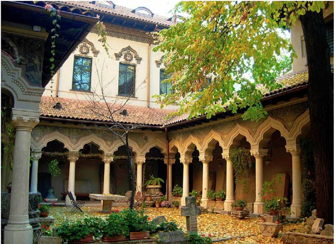
Figure 1: Ion Mincu, Stavropoleos monastery after the restoration, 1904–1907 / courtyard of the monastery, Bucharest, 1912.