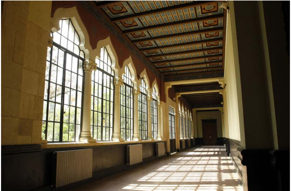
Figure 8: Ion Mincu, Central School for Girls, Bucharest, 1890. Inner courtyard.