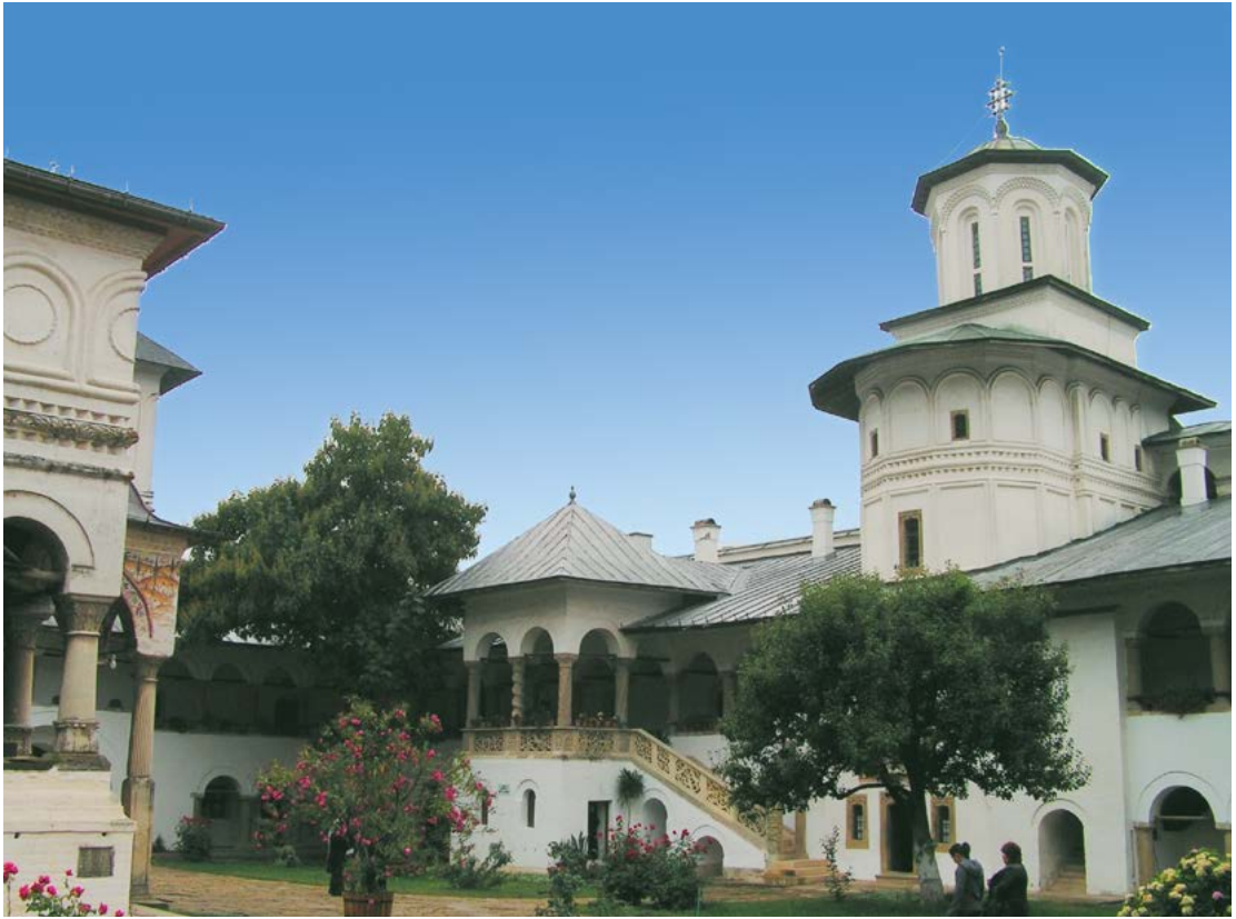
Figure 10: Dionisie Tower, inside courtyard of Hurezi Monastery, 1693.