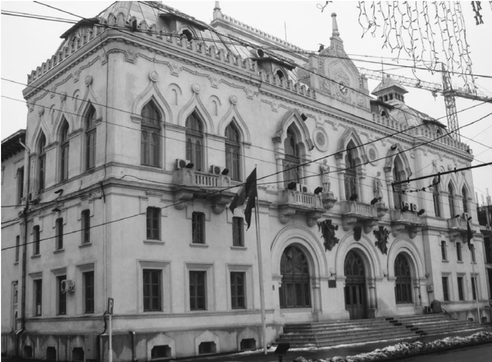
Figure 4: Ion Mincu, Administrative Palace, Galați, 1905.