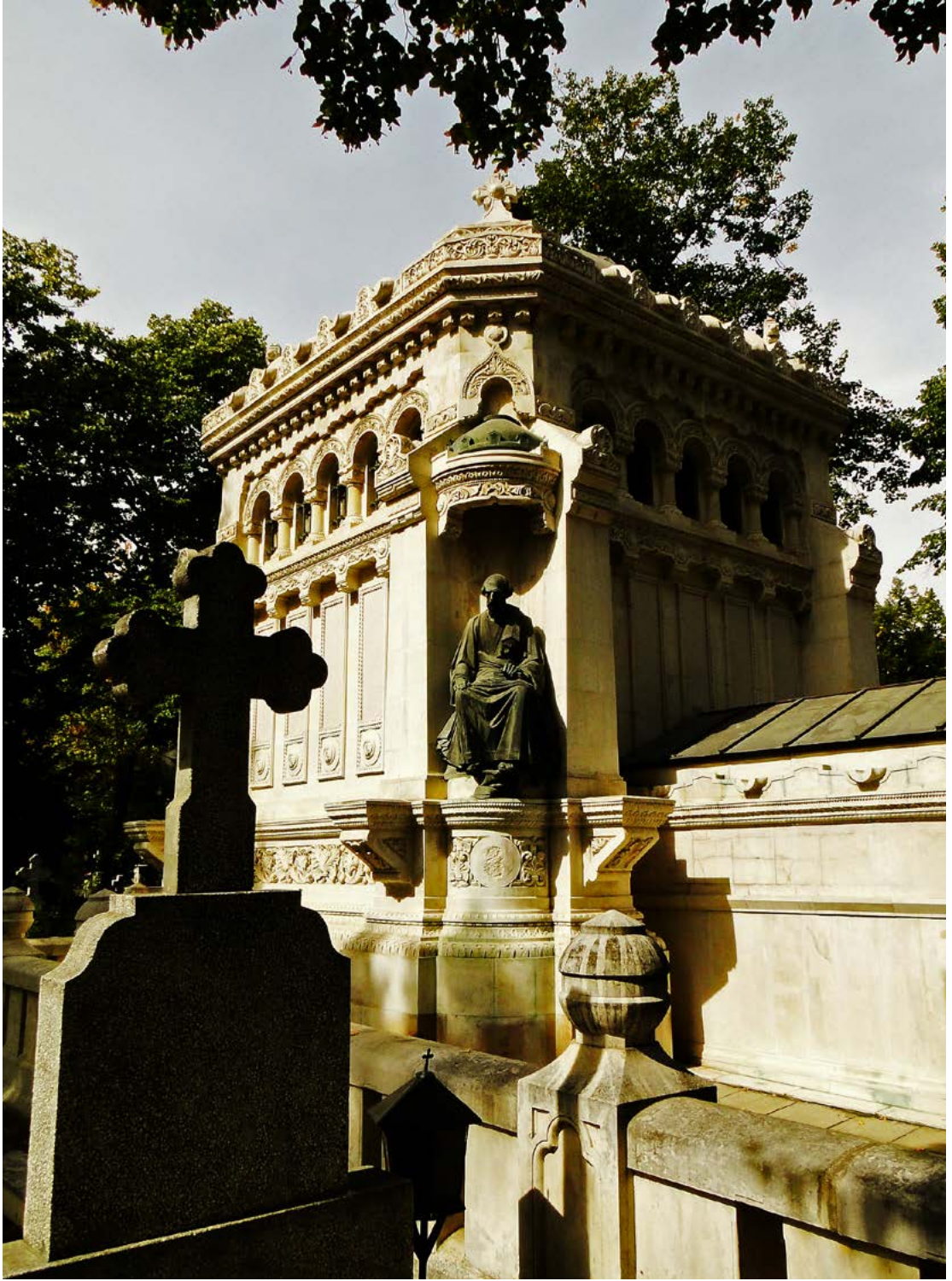
Figure 6: Ion Mincu, Georgiev Chapel, Bellu Cemetery, Bucharest, 1902–1907.