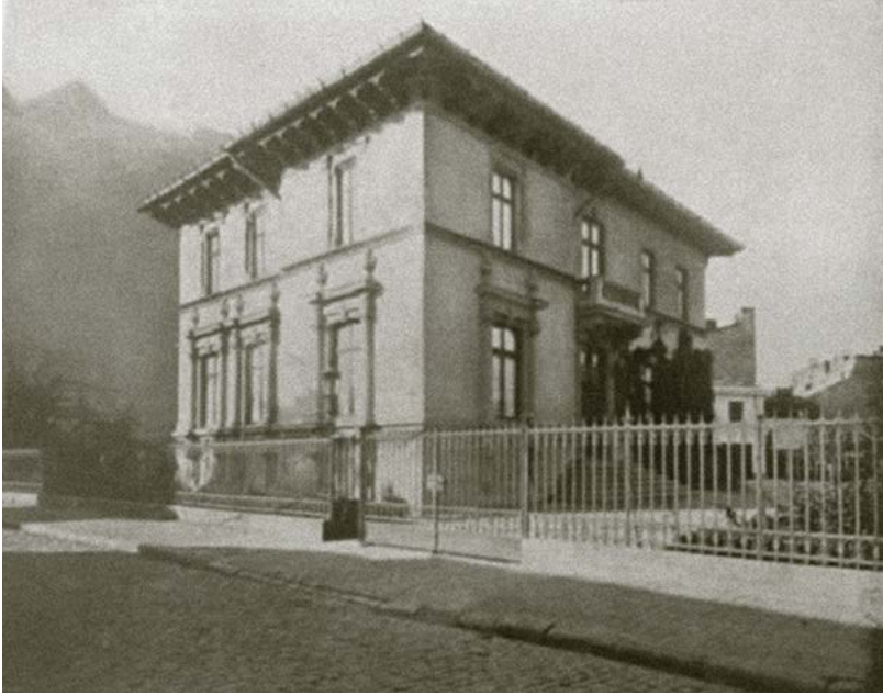
Figure 3: Ion Mincu, Robescu House, Bucharest, 1889.