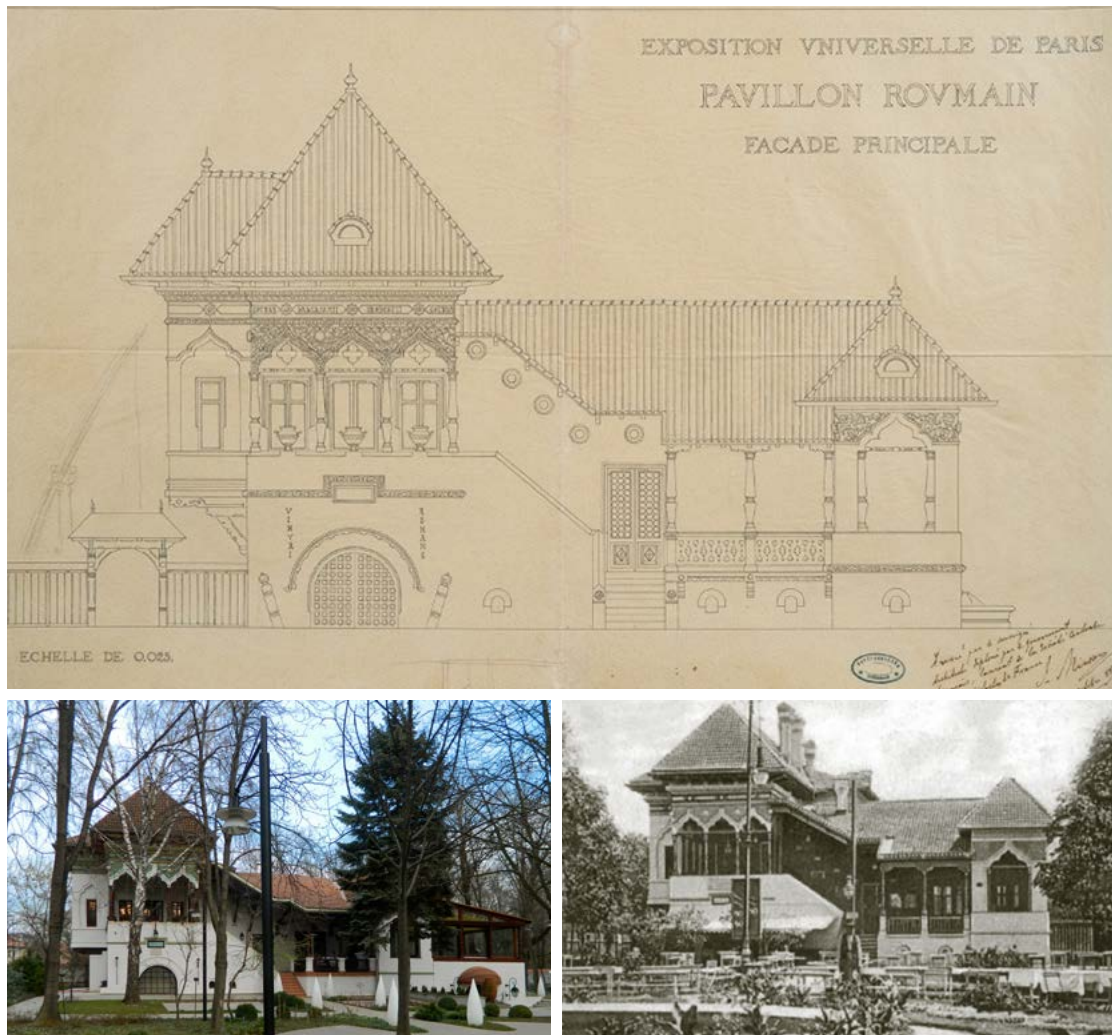
Figure 9: Ion Mincu, Romanian Restaurant, 1888. Elevation for the Romanian Pavilion at the 1889 Paris World Fair / front façade / side façade with the first-floor balcony.