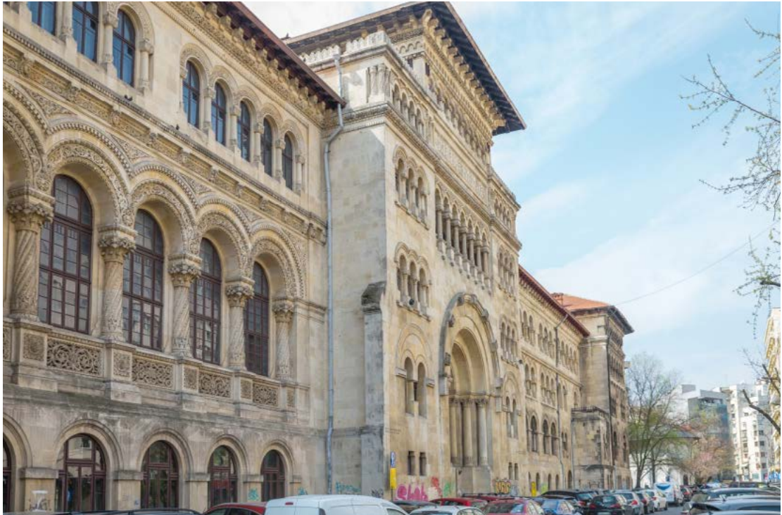
Figure 2: Grigore Cerchez, Institute of Architecture, Bucharest, 1921–1927.