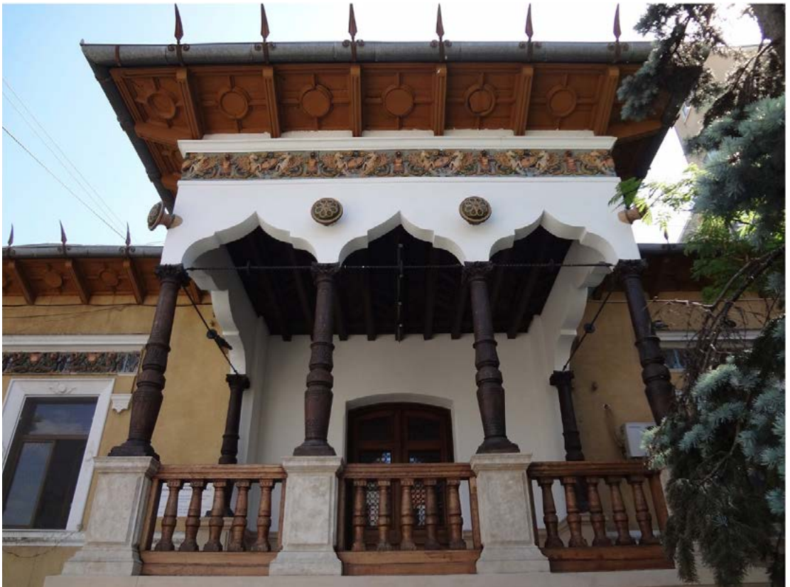
Figure 7: Ion Mincu, Lahovari House, Bucharest, 1886. Front façade / detail with the front porch.