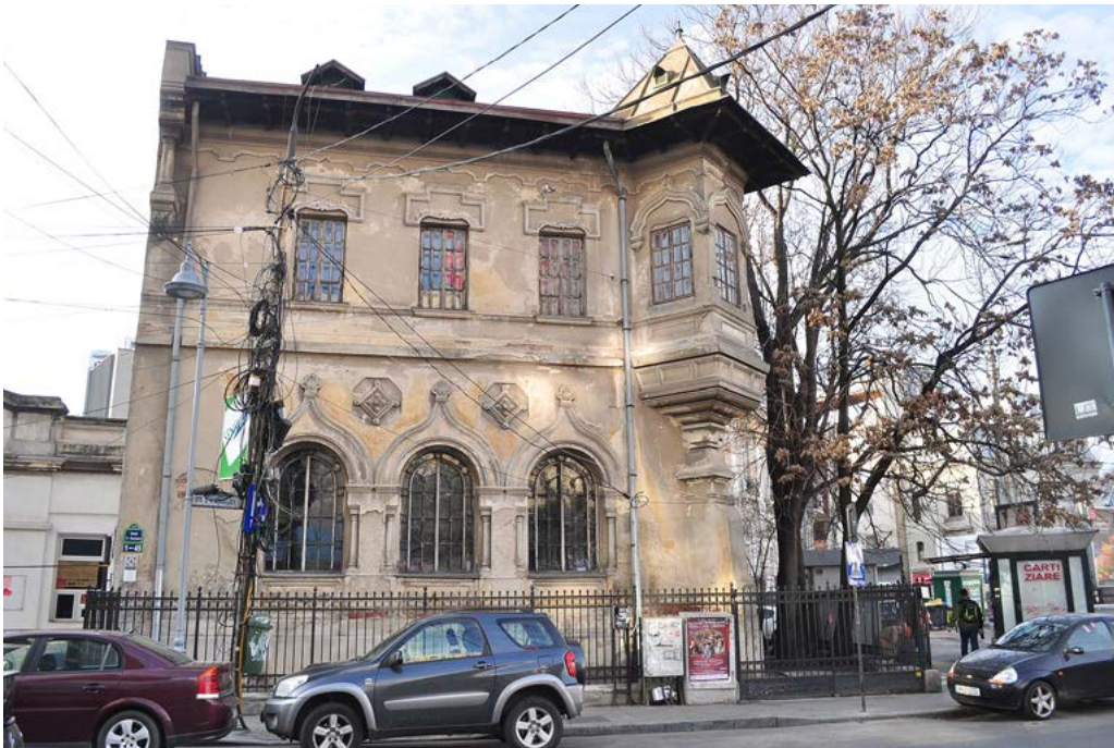
Figure 5: Ion Mincu, Petrașcu House, Bucharest, 1906–1907.